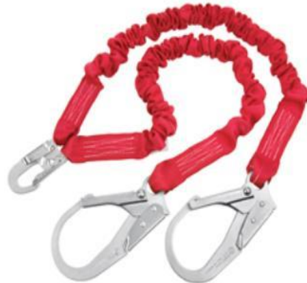
1340161 – Pro Stretch 100% Tie-Off Shock Absorbing Lanyard