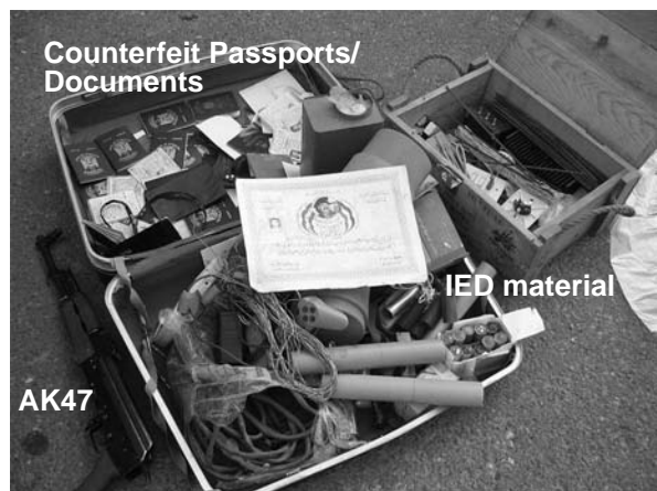
Captured insurgent material. 2BCT learned the hard way that it's not enough merely to seize evidence. Contraband must be properly handled and documented to aid in insurgent prosecution.

We discovered that identifying and training an informant was a complex and time-consuming process. Finding the right type of individual willing to work with you is both an art and a science. Our counterintelligence-trained Soldiers were instrumental in ensuring that we worked with the most reliable, most