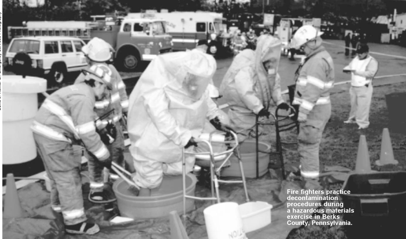
Urban emergency services, including police, paramedics and fire fighters, offer a useful model for the operational level of war in asymmetric environments. With insufficient resources to prevent all accidents, crimes and fires, city managers cannot plan to be in the right place at the right time in advance, but they can implement mechanisms in advance to monitor and respond with the critical resources necessary. These are the bases of coping mechanisms.

ing mechanisms. JTFs are not part of standard military organizations in garrison. Just the opposite is true; garrison forces are pure and rarely join a heterogeneous force. Without standing JTFs, garrison and learning operational readiness will be weak.