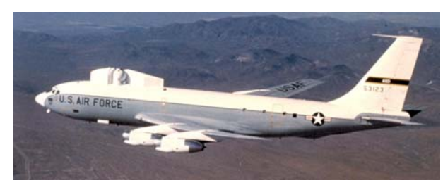
The Airborne Laser Laboratory Aircraft

The final test for the ALL took place in September 1983. In a joint experiment with the Navy, the ALL shot down and destroyed three 23-foot-long, ground-launched, BMQ-34A Navy drones. The interception and destruction of the three drones signaled that the ALL program was a resounding success, proving that the goal of airborne anti-missile defense was indeed realistic. While the ALL was retired in 1984, it served as the technical bridge for the current Airborne Laser (ABL) program, which was initiated by the Air Force in 1996.