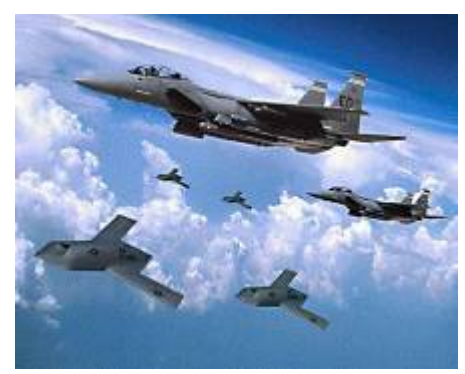
"Swarm" of UAVs & Other Flight Vehicles

guidance and mission planning systems of most UAVs do not have the ability to recognize and react to unexpected changes in operating conditions. This problem is greatly compounded when additional agents are added to the scenario, as may be the case with swarms of UAVs. <sup>34</sup> In this case, each vehicle must resolve information regarding actions and impending activities of the other vehicles and be able to communicate effectively its actions with manned and other unmanned members of its team, as well as with other teams of vehicles and control centers providing ancillary support to the mission.