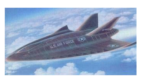
Concept for a Future Hypersonic Aircraft

Of particular interest to the joint AFOSR program are research projects that focus on the rapid discovery of new/novel ceramic materials that are both lightweight and high-temperature-tolerant (>1500°C), such as borides, carbides, and nitrides of early transition materials. To facilitate their use, these materials' resistance to oxidation must be improved, and lower cost processing routes to complex shaped components must be discovered. These materials could be used to control chemical reactions in the vehicle