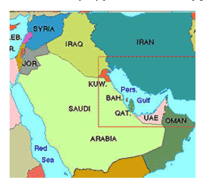
Figure 2. Persian Gulf Region<sup>15</sup>

Geographically the Persian Gulf region comprises eight coastal states bordering the body of water known as the Persian (or Arabian) Gulf. The member states include Saudi Arabia, Iran, Iraq, Kuwait, Bahrain, Qatar, Oman, and the United Arab Emirates (UAE). Collectively the Persian Gulf states have a population of over 129.8 million people, of which 68 million are Iranian.<sup>13</sup> Islam is the dominant religion and plays an important role in governance, as does the split between the Sunni and Shiite sects.<sup>14</sup> Before the fall of Saddam, Iran stood as the only Shiite ruled nation but current indications suggest the Shia will hold a majority position in the new Iraqi government.