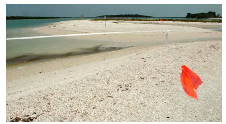
Symbolic fencing protecting beach nesting bird habitat.

For the purposes of negotiations of Offsets with BP in accordance with the Framework Agreement, the Trustees used widely accepted methodologies. Habitat Equivalency Analysis (HEA) was used to