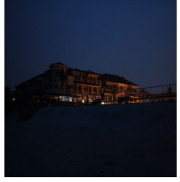
Impacts of light pollution controls: Before and after.