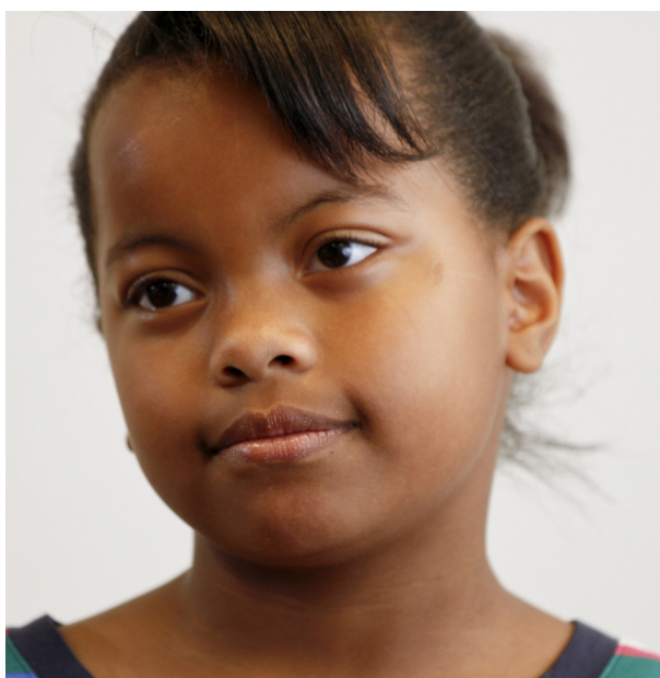
ACUTE LEUKEMIA TREATMENT