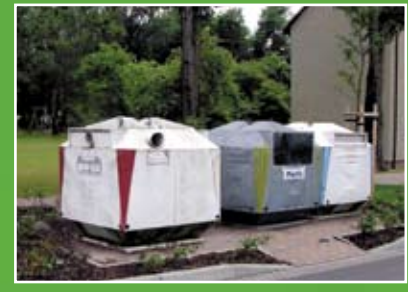
Recycling Point type 1

Confused? Something not listed? Suggestions? Ways to improve our program? Please let us know.