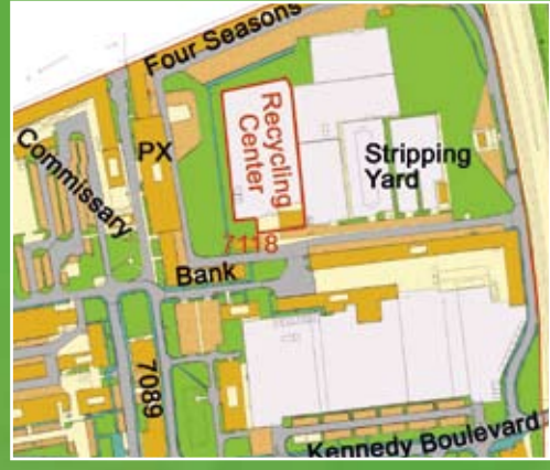
The Recycling Center is in Warner Barracks III behind the Community Bank.

If you have large amounts of cardboards, styrofoam and other recyclables, bring it to our Recycling Center. Do you have bulk refuse that doesn't fit in your normal trash container? Our Recycling Center is the right place.