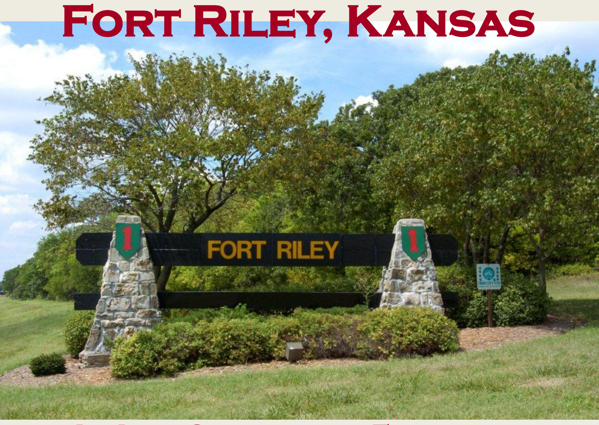
AN ARMY COMMUNITY OF EXCELLENCE