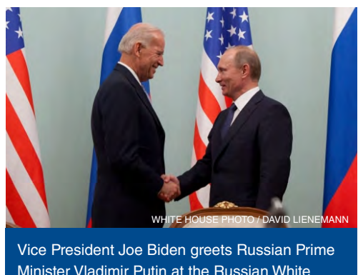
Minister Vladimir Putin at the Russian White House, in Moscow, Russia, March 10, 2011.