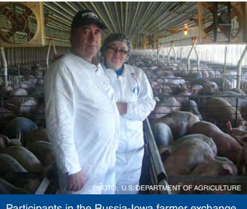
Participants in the Russia-lowa farmer exchange trip, 2011.

Also in August 2011, the Working Group began the first phase of its "Best Practices in Agricultural Sustainability" program. In partnership with the Iowa Farm Bureau, Iowa State University, and AKKOR, USDA hosted four Russian agricultural experts who traveled to the Midwest to study technologies and practices. Participants attended the Iowa Farm Bureau Federation Summer Policy Conference and stayed with Iowa farm fami-