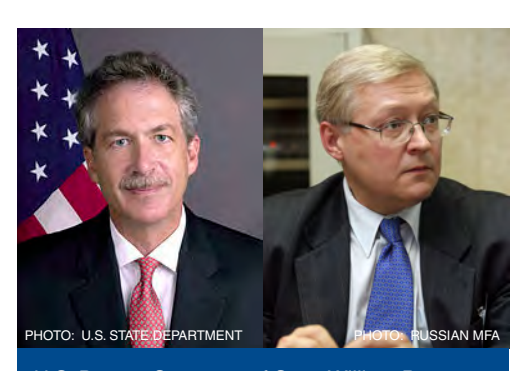
U.S. Deputy Secretary of State William Burns (left) and Russian Deputy Foreign Minister Sergey Ryabkov (right).

The co-chairs share the intention to intensify the joint efforts of U.S. and Russian agencies, business, scientific, cultural, and public circles, extending them to new areas, so as to give the Presidential Commission a truly universal character and to increase its effectiveness. The goal is to build up a multifaceted partnership between the United States and Russia, based on the purposes and principles of the U.N. charter.