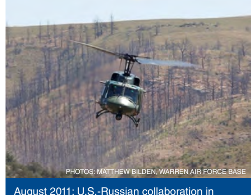
August 2011: U.S.-Russian collaboration in action during exercise CRIMSON RIDER 2011.