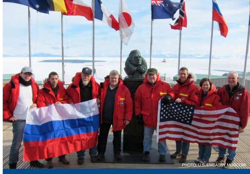
United States and Russian Federation Joint Inspection in Antarctica, January 2012.

In 2011, the Working Group made progress toward the deepening of cooperation between the United States and the Russian Federation in the cross-boundary Bering Strait region with the goal of expanding interaction between protected areas in Alaska and Chukotka. In addition, there was Working Group participation in the Russian-American Pacific