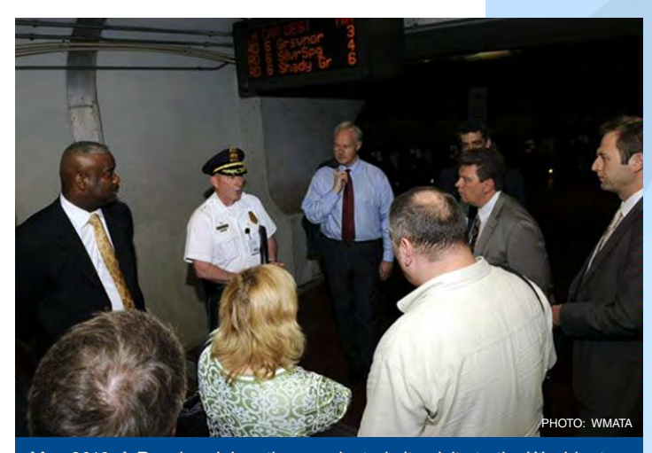
May 2010: A Russian delegation conducted site visits to the Washington Area Metro Transit Authority to watch a counterterrorism exercise, and the Transportation Security Administration Operations Center in Herndon, Virginia. Here, Russian transportation security authorities are briefed on the Rail Safe Operations Exercise at Washington, D.C.'s Union Station.

In May 2011, our two countries' Presidents reaffirmed a common assessment of the threat to global security posed by al-Qa'ida and made a commitment to close cooperation to disrupt, dismantle, and defeat this terror-