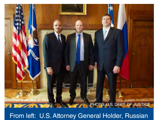
From left: U.S. Attorney General Holder, Russian Deputy Justice Minister Lyubimov, and Russian Minister of Justice Konovalov.

n May 2011 in Deauville, France, the Presidents of the United States and Russia announced the establishment of the Bilateral Commission's Rule of Law Working Group to promote enhanced bilateral cooperation on legal issues between the U.S. Department of Justice and Russian Ministry of Justice. U.S.