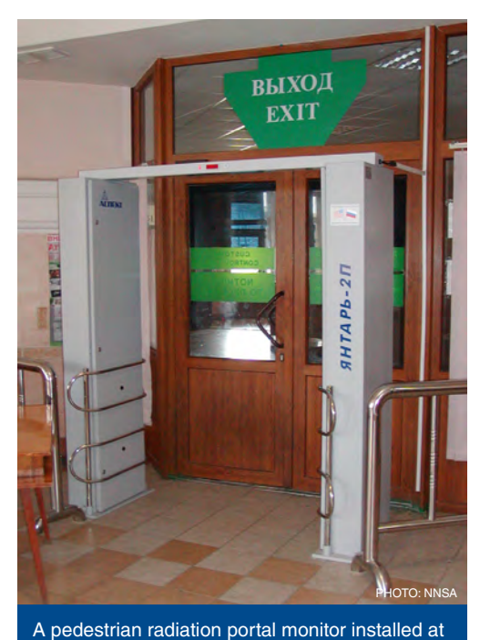
the Pogranichny (Grodekovo) Rail Station on the Russian border with China.

Serbia and Ukraine. Two U.S.-Russian seminars were organized to exchange experiences on design, exploitation and support for security of fast-neutron research reactors and on waste management in the United States and Russia.