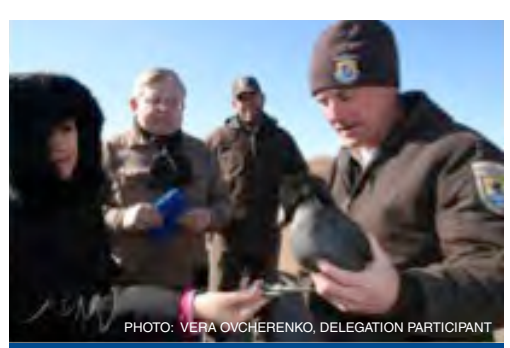
December 2011: Russian environmental experts visit Bosque del Apache National Park, New Mexico, an important location for migratory birds including geese from Wrangel Island, Russia.

(APEC) Environment Ministerial. The Working Group will develop proposals on e-waste and explore expanded collaboration on hazardous and solid waste (management, storage, and clean-up). We seek to deepen ties on environmental crime through additional joint Department of Justice and Ministry of Justice programming. Wildlife and habitat conservation, protected area management, and forest-related cooperation provide the backbone for our joint environmental cooperation and we intend to expand related exchanges and programs, particularly in our shared Beringia region.