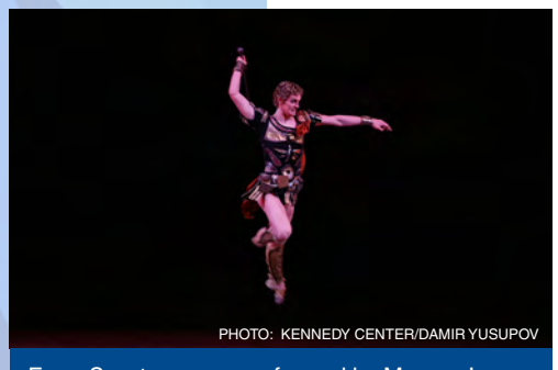
From Spartacus , as performed by Moscow's Bolshoi Ballet at the Kennedy Center in Washington, D.C., February 2010.