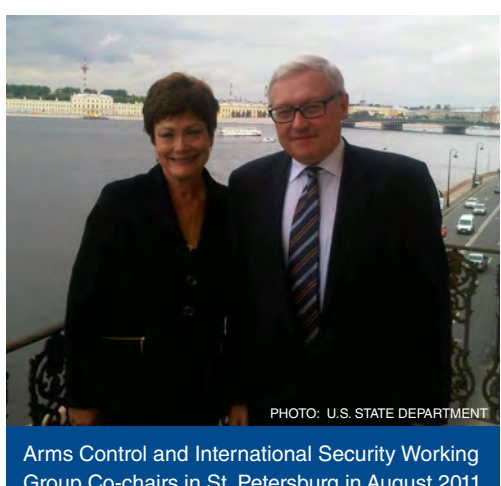
Group Co-chairs in St. Petersburg in August 2011.

The Working Group met in a full interagency plenary format in January and December 2011 in Washington D.C., and in August 2011 in St. Petersburg. A wide range of issues was discussed, including strategic stability, missile defense, space, WMD nonproliferation challenges, and conventional arms control in Europe. In addition, regular meetings of the two co-chairs were held, mainly focusing on the issues of missile defense and strategic stability.