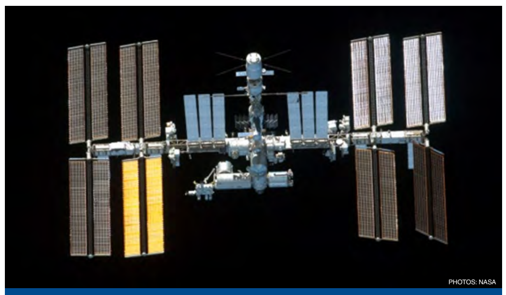
The International Space Station (ISS), as photographed by the STS-134 crew on the space shuttle Endeavour in May 2011.

space exploration beyond low-Earth orbit, the Working Group noted discussions within the multilateral International Space Exploration Coordination Group.