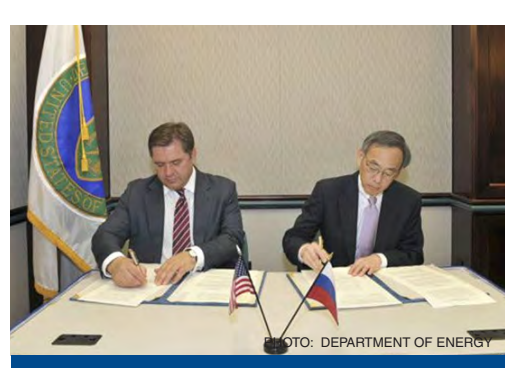
July 2010: U.S. Secretary of Energy Steven Chu and Russian Minister of Energy Sergey Shmatko sign the Energy Working Group Joint Statement on future cooperation.

to implementing "smart grids" in Russia's power and electricity market. In St. Petersburg, the Energy Efficiency in Public Buildings Initiative is assisting the municipality to improve efficiencies as mandated by Russian federal legislation. In order to develop cooperation on increasing energy efficiency and the level of energy management in public buildings in Russia, a meeting memorandum between the St. Petersburg Administration and the U.S. company Honeywell was signed on September 29, 2011. In accordance with this agreement, the two sides will identify potential sites suitable for a project to increase energy. Additionally, an Energy Efficiency Trade Mission designed to promote businessto-business links in the area of clean energy took place in December 2011. Leaders from 16 small and medium-sized companies from Belgorod, Yakutia, Chelyabinsk, St. Petersburg, and Kaluga traveled to Austin and San Diego to meet with their U.S. counterparts. A second, reciprocal energy efficiency trade mission to Russia for U.S. small and mediumsized companies is planned for June 2012. The planning process has started for a joint pilot project in Yakutia that will assess emissions inventories, find point-source emissions, and develop technology for mitigation of black carbon, a known short-term climate forcing agent.