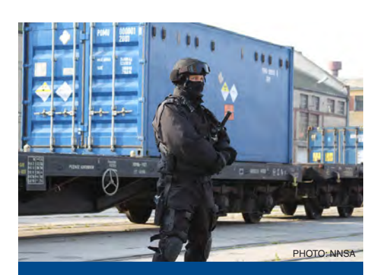
More than 1,000 pounds of highly enriched uranium spent fuel--enough to make 18 nuclear weapons--are being returned from Poland to Russia.

All the while, joint work continued on U.S.-origin and Russian-origin fuel returns from third countries. Shipments completed to date include U.S.-origin material from Turkey, Taiwan, Japan, Israel, and the Republic of South Africa, and Russian-origin material from Bulgaria, Latvia, Romania, Libya,