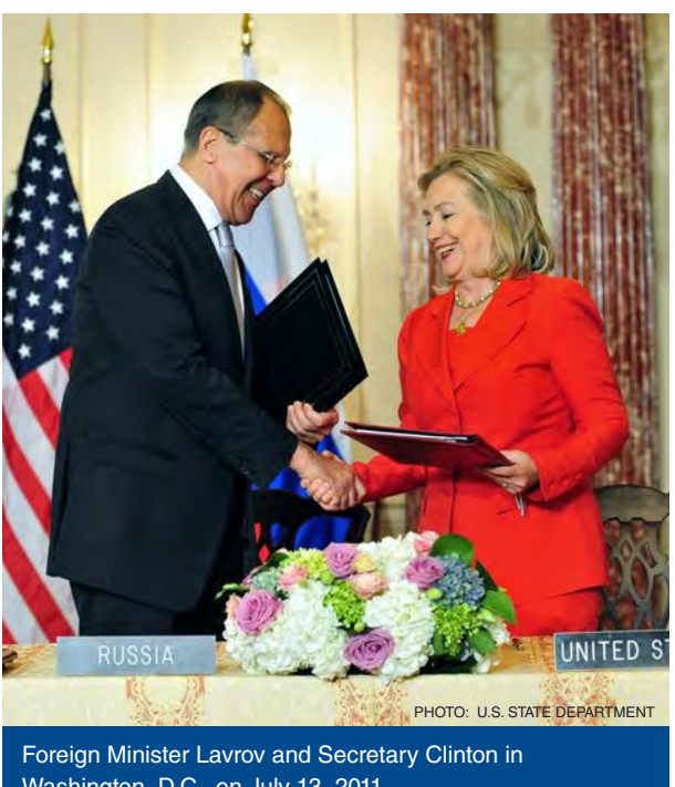
Washington, D.C., on July 13, 2011.

he U.S.-Russia Presidential Commission continues to broaden and deepen cooperation between our governments and peoples to advance common interests. Over the past year, the Commission's structure has grown, with working groups on innovation and rule of law added to the now 20 working groups that are producing practical results. Over sixty U.S. and Russian government agencies now support the work of the Commission and have facilitated over 400 meetings, exchanges, exercises, and other joint projects since the Commission's start. The Commission has also served as a