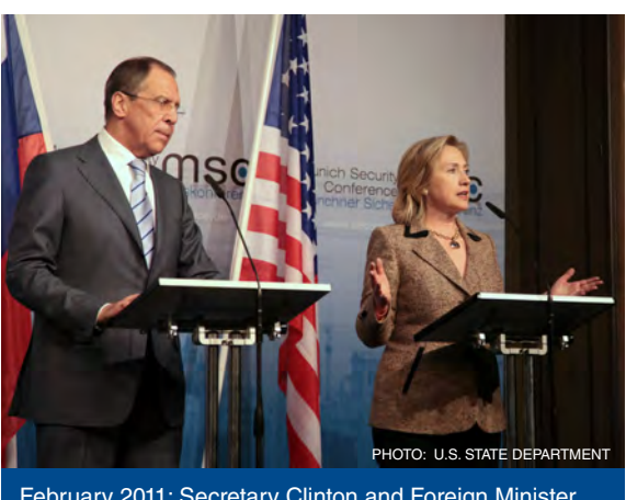
February 2011: Secretary Clinton and Foreign Minister Lavrov address the media after bringing the New START Treaty into force in Munich, Germany.

will turn our attention to advancing Russia's bid to join the OECD and leveraging innovation to bolster the competitiveness of our companies and workforces. And we are confident that the Commission's work will continue to benefit all Americans and Russians as we seek ways to increase our educational and professional exchanges, to find new avenues of cooperation in the public health and other social sectors, and to bring civil society actors together to discuss common challenges. The United States and Russia commit to take full advantage of the Commission's capabilities to advance common interests and unlock the creative and entrepreneurial potential of our societies in the months and years ahead.