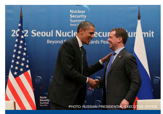
President Obama and President Medvedev meet on March 26, 2012 during the Nuclear Security Summit in Seoul, South Korea.

Combined U.S. and Russian efforts to strengthen bilateral economic cooperation helped to secure an invitation for Russia to join the World Trade Organization (WTO). Two-way trade and investment increased with Boeing aircraft sales to Aeroflot and UTAir, Rosneft's joint venture with ExxonMobil to explore Arctic oil and gas fields and to increase Russian investment in Texas, and with joint ventures between General Electric and Inter RAO UES and Rostekhnologii.