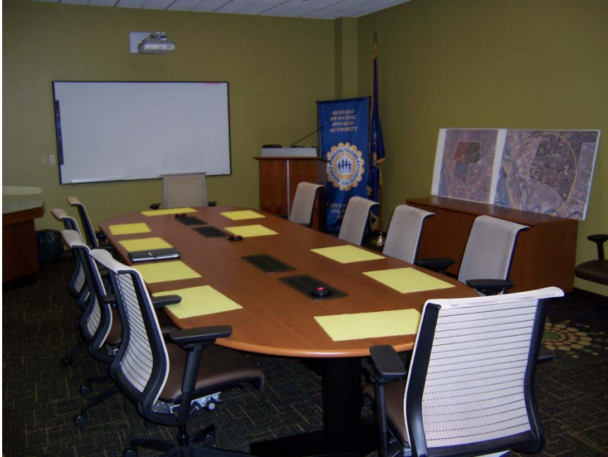
Authority officials used Recovery Act funds to purchase furniture and equipment for use in their boardroom located at the administrative office. The picture above shows items purchased with the funding, including an interactive whiteboard, wall-mounted projector, and furniture.