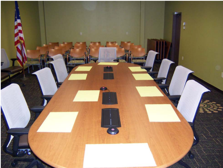
Above is another picture of the furniture purchased for the Authority's boardroom using Recovery Act funds.