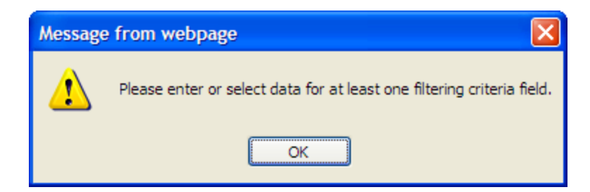
Exhibit 1: Select a Filter Message

If you click the Filter button without having selected any filters, a message displays instructing you to select a filter.