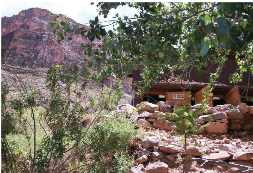
Figure 3. Bank of composting toilets on the trail.