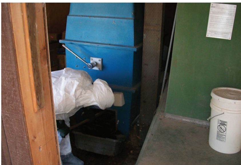
Figure 5. Employee in Tyvek clothing bending over to shovel out the vault of a composting toilet.