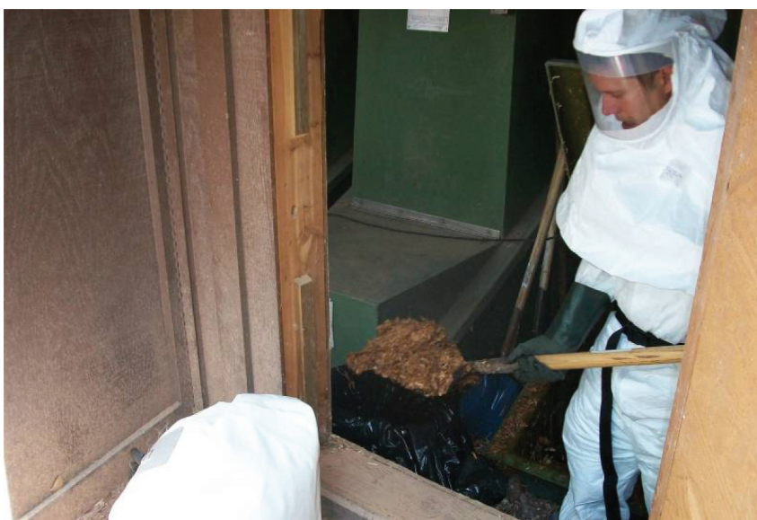
Figure 4. Employee wearing hooded PAPER shoveling wood chips saturated with liquid out of a composting toilet.