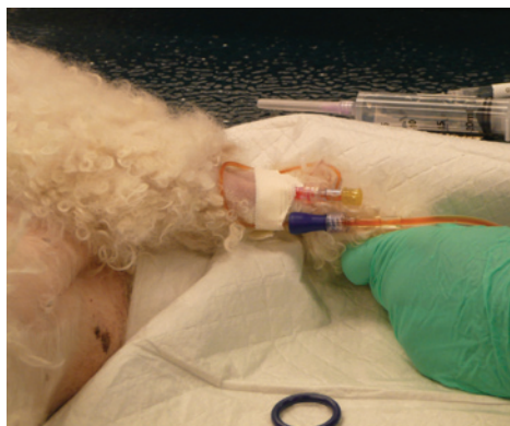
Figure 2. Intravenous administration procedure for doxorubicin.