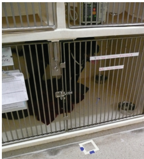
Figure 3. A chemotherapy drug-treated canine in a labeled kennel. The label warned employees of potential chemotherapy drug cross contamination and identified the chemotherapy drug used.

administration. Animals were placed on the treatment table and prepared by shaving and disinfecting the area where the IV catheter was placed. The administering technician then injected the chemotherapy drug. Figure 2 illustrates a chemotherapy drug injection process.