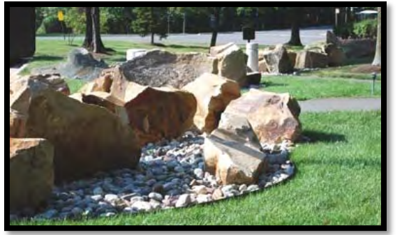
Stone can be used as a functional and aesthetic barrier.

Soda ash —Soda ash is used as the feedstock to make sodium bicarbonate (baking soda) used in fire extinguishers. In the event of a chemical spill from one of the laboratories, it could be used to neutralize acid spills or other chemical leakage.