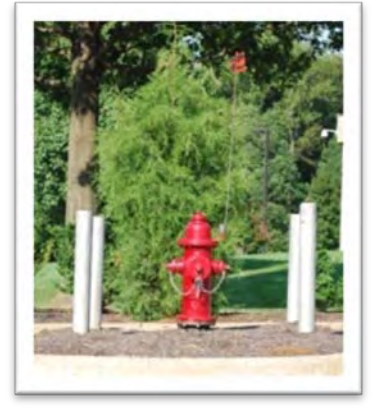
Iron and steel used in guard posts provides a strong barrier.

Iodine imparts antibacterial properties to soap used in restrooms.