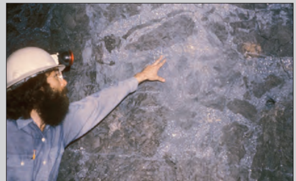
The Viburnum Trend in southeastern Missouri contains the largest concentration of lead in North America. The Buick mine is one of six underground mines that currently produce lead in the Viburnum Trend ore district.

Mineral resource assessments are dynamic. Because they provide a snapshot that reflects our best understanding of how and where resources are located, the assessments must be updated from time to time as better data become available and new concepts are developed. Current research by the USGS involves updating mineral deposit models and mineral environmental models for lead and other important nonfuel commodities and improving the techniques used to assess for concealed mineral resource potential. The results of this research will provide new information and decrease the amount of uncertainty in future mineral resource assessments.