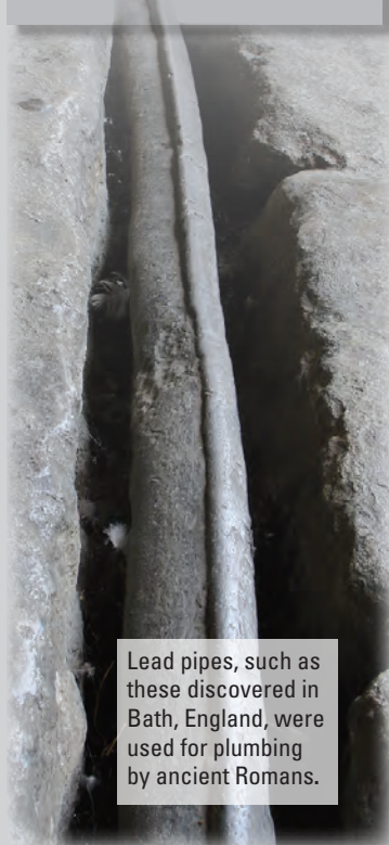
Lead pipes, such as these discovered in Bath, England, were used for plumbing by ancient Romans.

Typical lead-acid ignition batteries in automobiles contain about 10 kilograms of lead and need to be replaced every 4 to 5 years. Lead-acid batteries also supply standby power for computer networks and telecommunications systems and energy storage for wind and solar energy systems and hybrid-electric vehicles.