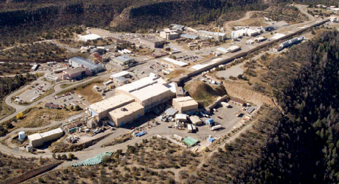
IPF is Icoated at the Los Alamos Neutron Science Center