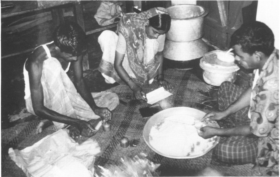
Plate 4 (a): Bengalis in Matlab mix the ingredients for oral rehydration solution and put them in small plastic packets for community distribution.