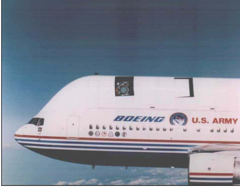
Airborne Optical Adjunct/Airborne Surveillance Testbed