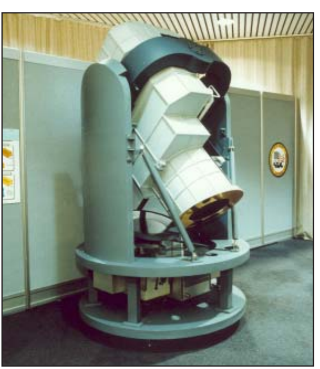
Ground Based Surveillance and Tracking System (GSTS)