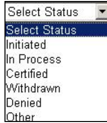
Figure 11. Case Status Drop-Down List