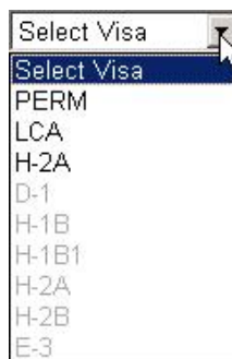
Figure 10. Visa Program Drop-Down List