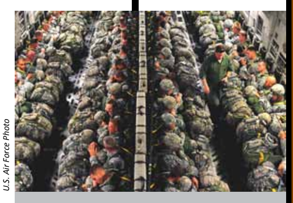
U.S. soldiers assigned to the 82nd Airborne Division prepare to parachute from an Air Force C-17 Globemaster.