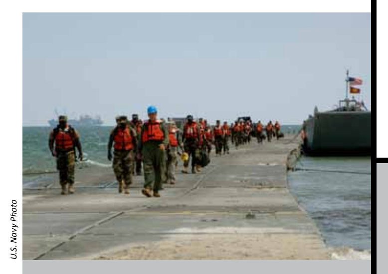
U.S. Service members disembark from Landing Craft Mechanized (LCM) 14 onto a causeway during Joint Logistics Over-The-Shore (JLOTS) operations.