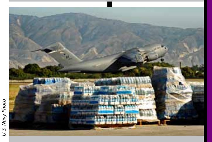
A U.S. Air Force C-17 transport aircraft lifts off from the runway at Aerodome de Jacmel in Port-au-Prince, Haiti, after delivering humanitarian supplies.