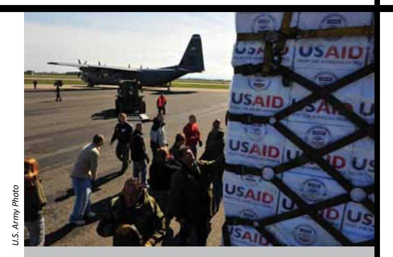
U.S. Air Force personnel load blankets, tarps and water containers bound for Tunisia onto a C-130 in Pisa, Italy.

We will explore avenues to adapt our processes and create incentives that will help us recover that business. We will also consider expanding, to the extent authorized under U.S. law, the scope of the DTS to provide cargo movement to non-DOD federal agencies and departments. Warfighters remain our most important customers, but offering transportation and distribution services to non-military agencies will help preserve our readiness, surge capability, and our objective of providing a coherent, cost-effective, whole-of-government approach to diverse mission requirements.