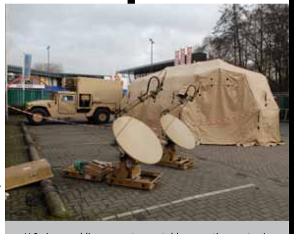
U.S. Army soldiers mount a portable operation center in Rotterdam, The Netherlands.

Air Mobility Command (AMC), an Air Force major command, is our Air Force component and provides airlift, aerial refueling and aeromedical evacuation capability.