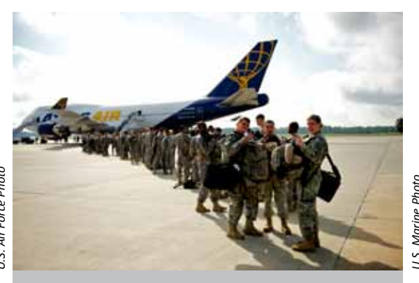
The U.S. Army 2nd Brigade Combat Team from Ft. Bragg, boards an Atlas Air aircraft at Pope Air Force Base.