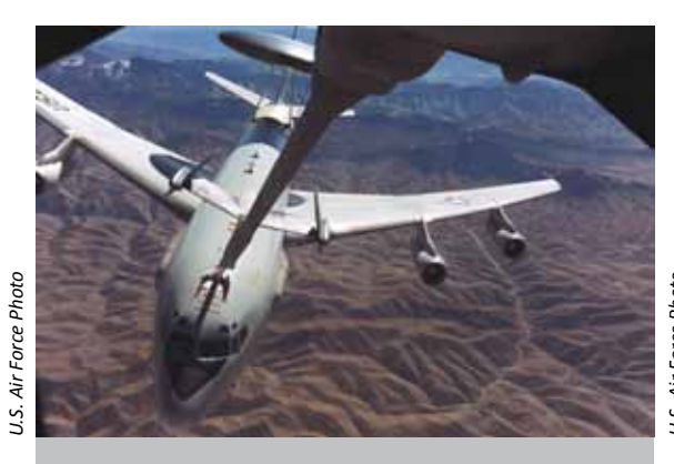
A U.S. Air Force E-3 Sentry receives fuel from a KC-10 while flying in support of Operation Enduring Freedom.

(Throughout this document, images or references to any specific commercial companies, product, or service by trade name, trademark, manufacturer, or otherwise, does not constitute or imply its endorsement, recommendation, or favoring by the United States Transportation Command or by any Department of Defense entity. Logos of or references to specific commercial companies used with permission.)