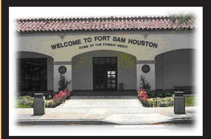
JBSA - FORT SAM HOUSTON