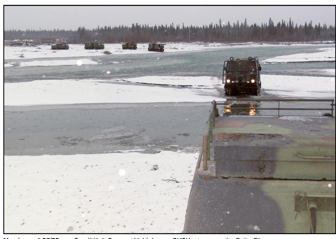
\label{lem:members} \textbf{Members of CRTC use Small Unit Support Vehicles}, or \textbf{SUSVs}, to cross the \textbf{Delta River}.

in the M113 to ensure conditions were still safe. Once the M113 was across, the three SUSVs forded the River without any trouble.