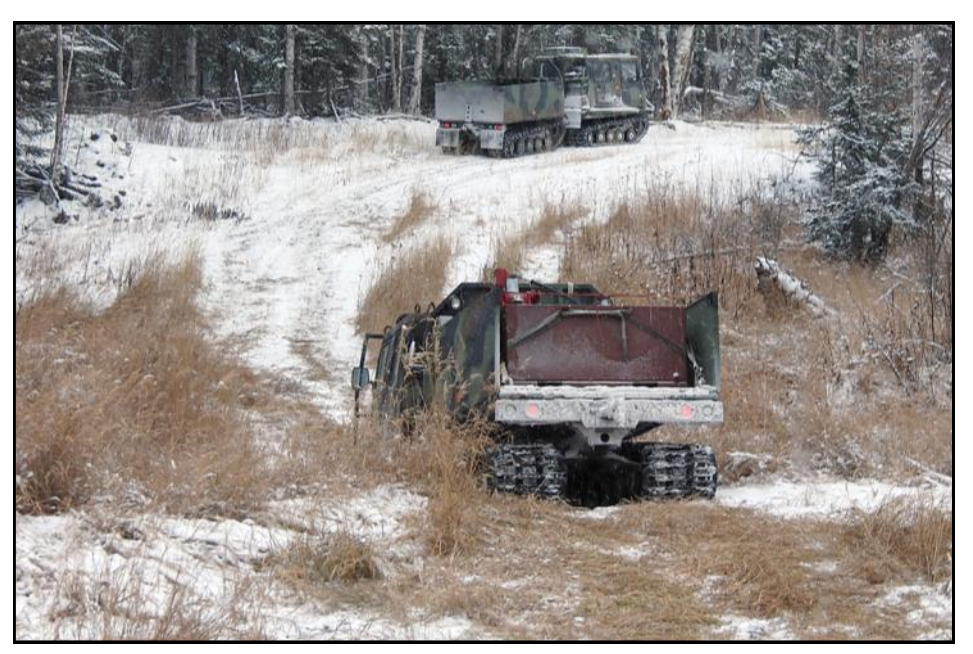
CRTC used Small Unit Support Vehicles, or SUSVs, to cross the Delta River in October.

aged to stage the majority of the equipment and supplies we'll need for remote operations for the next month," Viggato said.