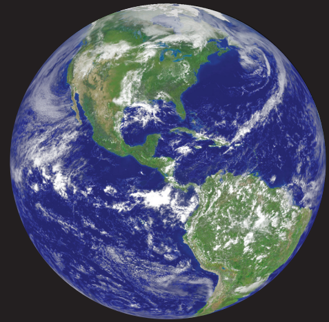
Atmospheric & Climatic Data