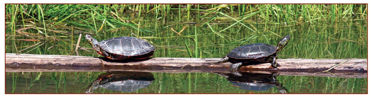
There is widespread wildlife and human exposure to several PFCs.