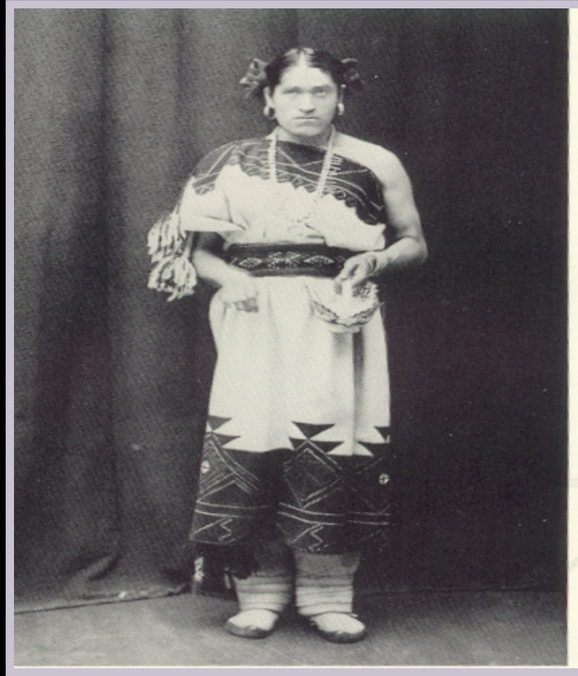
We-Wha (Zuni Tribe)