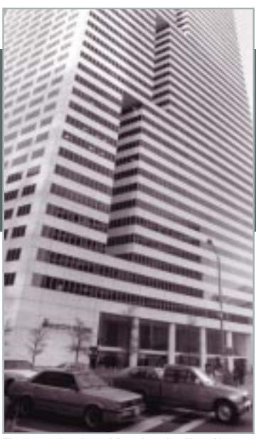
The investigation of fraud at the First City Bancorporation of Texas, Inc., has led to the conviction of seven individuals, restitution orders of over $10 million, and fines of $900,000.