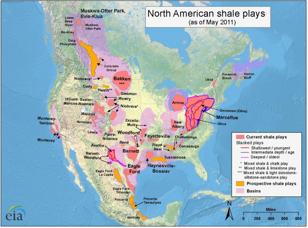
Source: U.S. Energy Information Administration based on data from various published studies. Canada and Mexico plays from ARI. Updated: May 9, 2011

Domestic production of shale gas also has the potential over time to reduce dependence on imported oil for the United States. International shale gas production will increase the diversity of supply for other nations. Both these developments offer important national security benefits.<sup>2</sup>