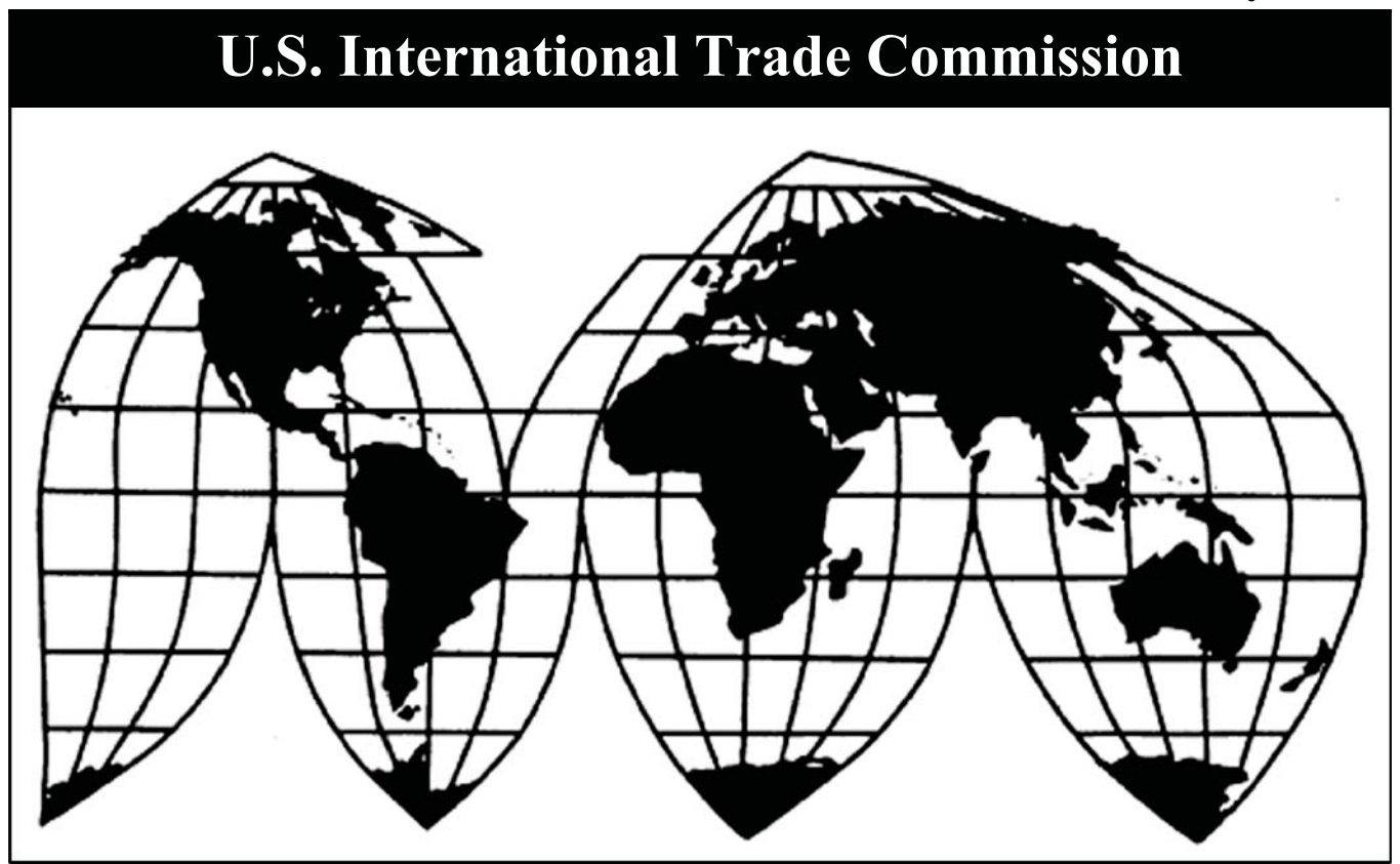
Washington, DC 20436