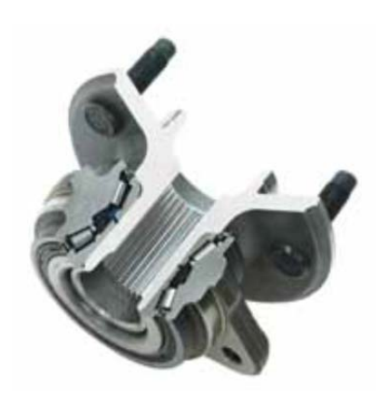
Figure 2. Gen 2 double flange tapered bearing

Figure 3. Gen 3 double flange tapered bearing