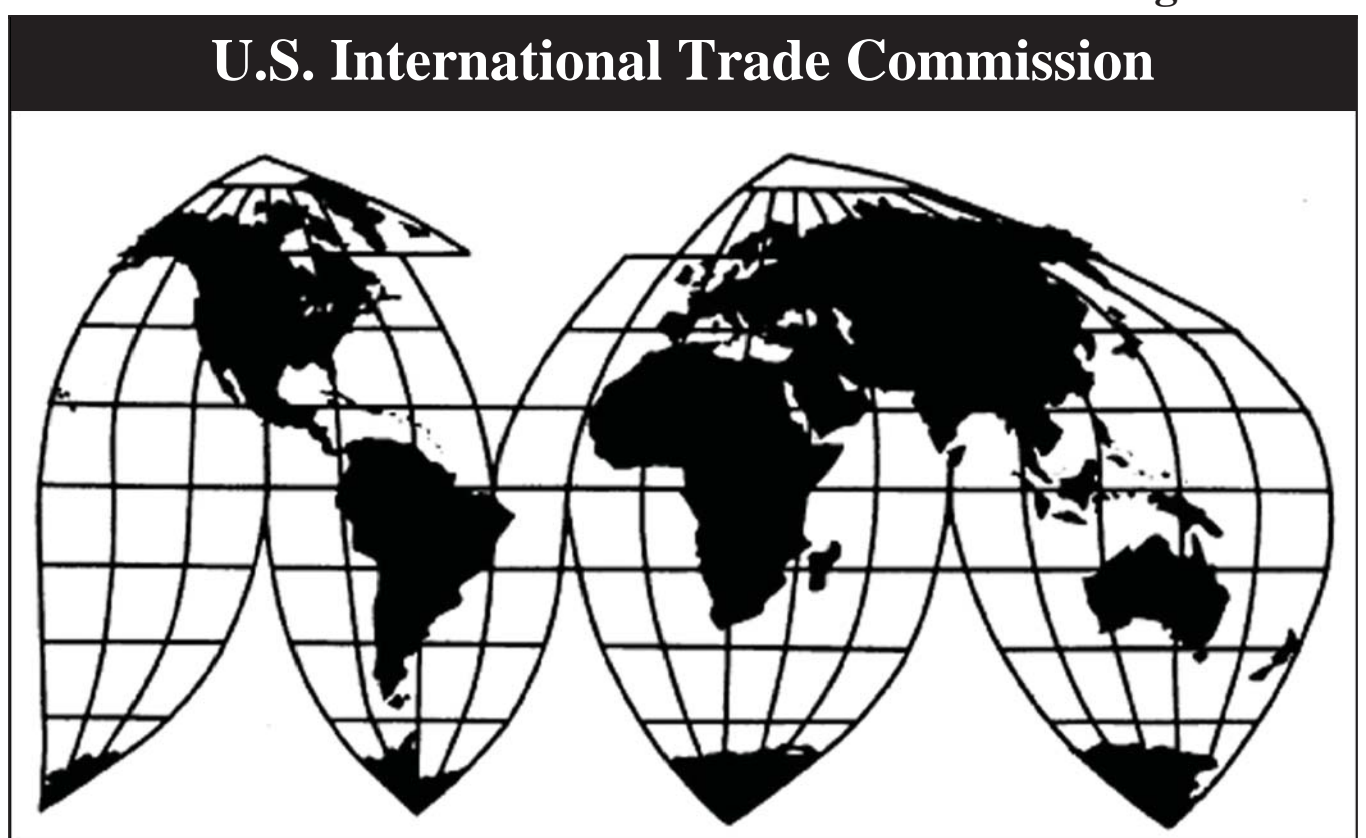
Washington, DC 20436