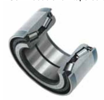
Figure 1. Gen 1 double row tapered bearing

Although wheel hub assembly construction varies among manufacturers, the assemblies typically share certain characteristics.<sup>33</sup> A Generation 1(Gen 1) wheel hub assembly typically is a double row tapered roller bearing that is pre-set to fall within certain parameters, such as internal clearance (figure 1). No adjustments are necessary when mounting the unit on a vehicle. A Gen 1 wheel hub assembly is prelubricated and sealed for life.<sup>34</sup>