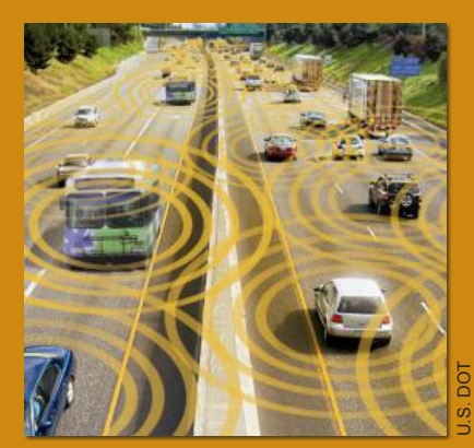
DSRC based communications serves as the basis for connected vehicle safety and mobility application integration