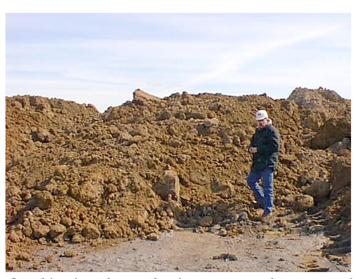
On this site, the coal mine operator has restored more than double the amount required for successful restoration.

Operators must complete the final grading in a timely manner; usually in time for the next growing season. This includes any subsoil or topsoil replacement and installation of erosion control measures such as terraces, diversions, grass waterways and drains.