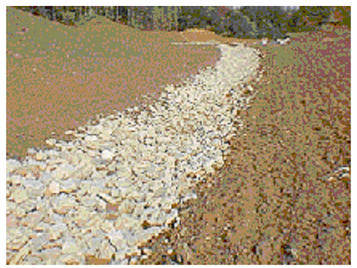
The success of erosion control measures will vary with different sites and must be carefully planned in advance of reclamation.