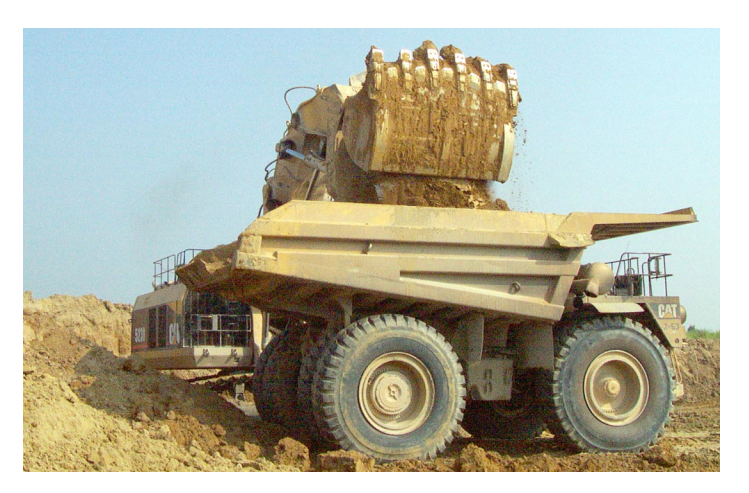
To ensure that adequate soil is available for restoration, soil is collected in advance of the mining operation...

Operations usually occur in the following manner. Scrapers or other machinery remove the topsoil and subsoil and directly redistribute it on graded overburden or stockpile it for replacement after mining. Seeding and mulching protect the topsoil from wind and water erosion. Stockpiles are marked as being topsoil or subsoil and protected with a cover of vegetation.