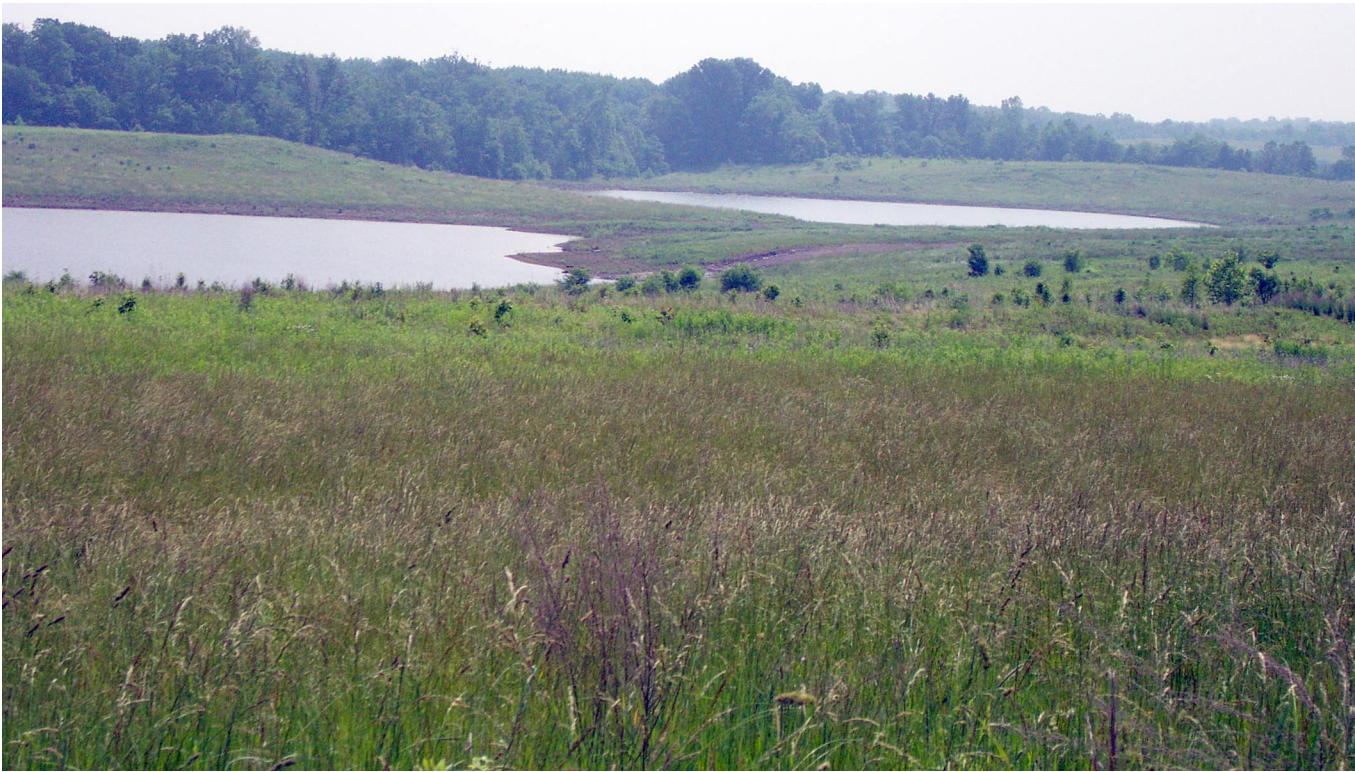
2000 National award winning reclamation at the Columbia Mine