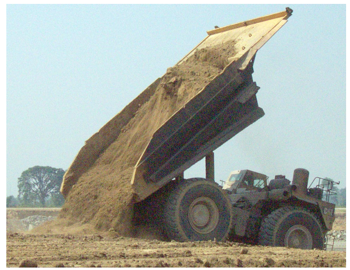
...and either moved to a separate location within the permit area or replaced immediately. Replacing and grading the soil as quickly as possible enhances post-mining productivity.

Before mining begins, operators must plan for the replacement of topsoil and subsoil after the coal has been removed. Details involving the removal, storage, replacement, and protection of the topsoil and subsoil from wind and water erosion are listed in the mine operation plan. Topsoil, which is removed in a separate layer from areas to be disturbed, is immediately re-distributed or stored on approved locations.