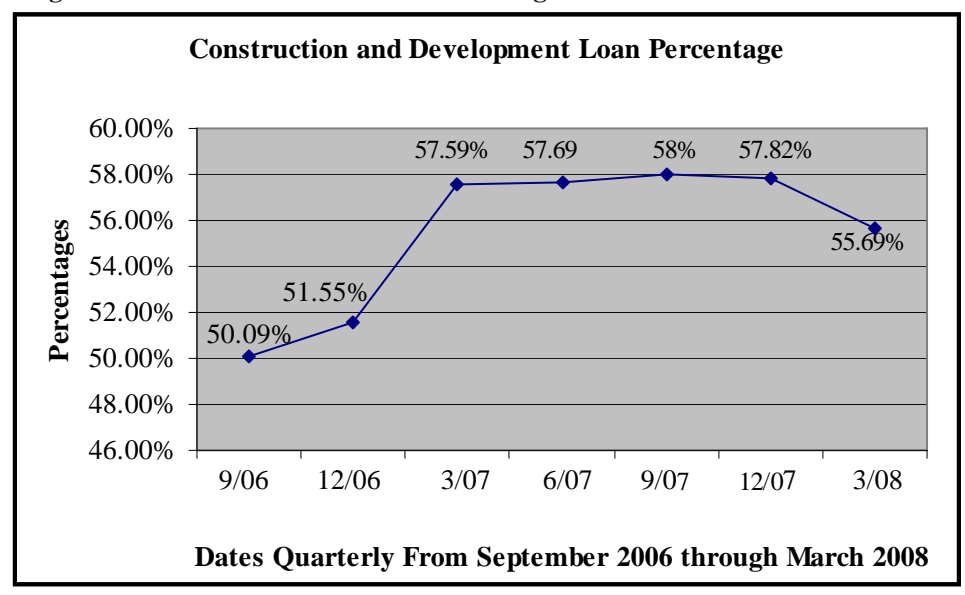
Figure 2: ADC Concentrations as a Percentage of Total Loans

Between the 2006 and 2008 examinations, the FDIC relied on various offsite techniques to monitor Heritage. The results of the offsite monitoring did not prompt additional supervisory review of Heritage. As indicated in Figure 2, ADC concentrations as a percentage of total loans increased during this same time frame as market conditions in the construction and development sector were also beginning to decline.