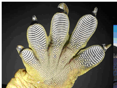
A New Adhesive That's Even Better than a Gecko's Toes

PIs/co-PI's can creatively showcase their work by uploading images with the report!