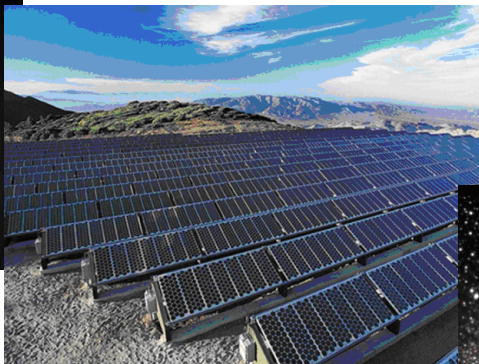
Researchers Produce More Efficient Solar Cells

These examples are illustrative of future Project Outcomes Reports, but are not real reports