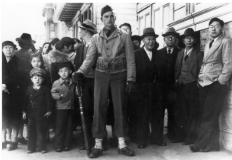
A crowd of onlookers on the first day of evacuation from the Japanese quarter in San Francisco (210-GC-426).

The 10 centers were located in Central Utah, Topaz, UT; Colorado River, Poston, AZ; Gila River, Rivers, AZ; Granada, Amachie, CO; Heart Mountain, Heart Mountain, WY; Jerome, Denson, AR; Manzanar, Manzanar, CA; Minikoda, Hunt, ID; Rohwer, McGehhe, AR; and Tule Lake, Newell, CA.