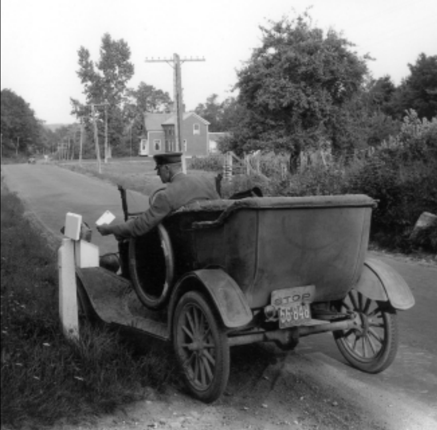
National Archives and Records Administration, Washington, DC Revised 2006