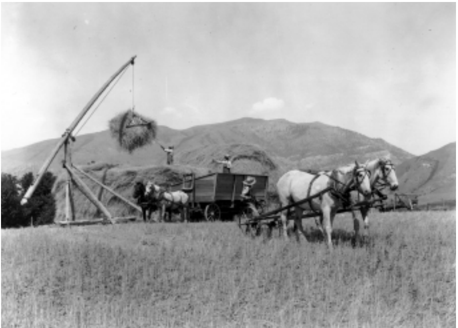
Unloading dry farm wheat (33-SC-5094c).

Nonpopulation decennial census schedules consist of agricultural, industrial and manufacturers, mortality, and defective, dependent, and delinquent classes (1880 only) as well as social statistics. The Bureau of the Census did not take all of these censuses in all years.