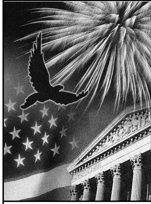
Get forms and other Information faster and easier by: Internet IRS.gov