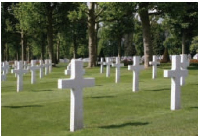
Oise-Aisne American Cemetery