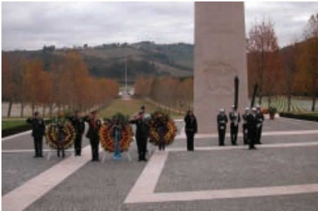
Junior ROTC ceremony at Florence American Cemetery