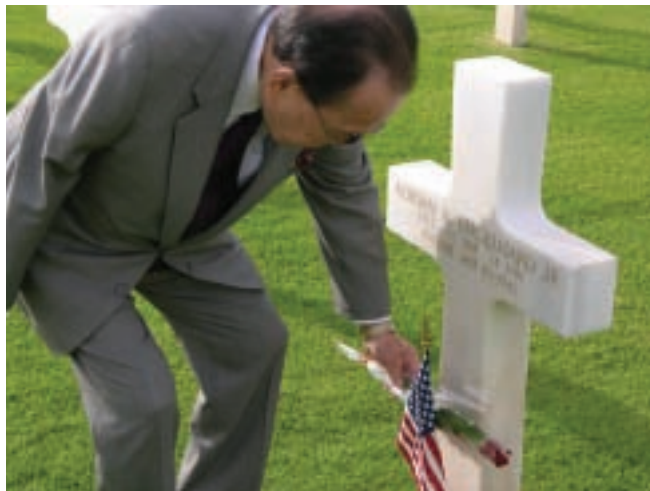
Senator Dan Inouye honors a soldier from Hawaii buried at North Africa American Cemetery

The Commission is cognizant of the importance of, and need for, management accountability and responsibility as the basis for quality and timeliness of program performance, mission accomplishment, productivity, cost-effectiveness, and compliance with applicable laws. It has taken management actions to ensure that the annual evaluation of these controls is performed in a conscientious and thorough manner according to Office of Management and Budget regulations and guidelines and in compliance with 31 U.S.C. 3512 (c), (d), commonly known as FMFIA. The