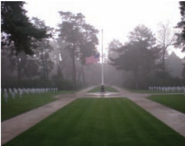
Brookwood American Cemetery