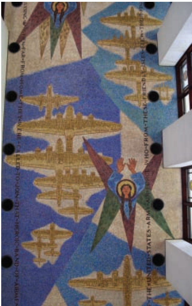
Cambridge American Cemetery ceiling mural

The Commission's headquarters office is in Arlington, Virginia and regional offices are located in Garches, France, just outside Paris, and in Rome, Italy. For fiscal year 2008, the Commission had a total of 404 full-time equivalent (FTE) positions. U.S. citizens constituted 70 members of the staff, while the remaining 334 were foreign service nationals employed at the Commission's regional offices and at the cemeteries in the countries where the Commission operates.