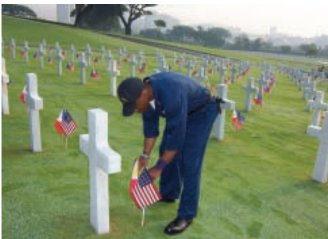
U.S. Navy sailor placing flags at Manila American Cemetery

Commission's evaluation of its system of internal management practices and controls during fiscal year 2008 revealed no material weaknesses. The objectives of the Commission's internal management control policies and procedures are to provide reasonable assurance that: