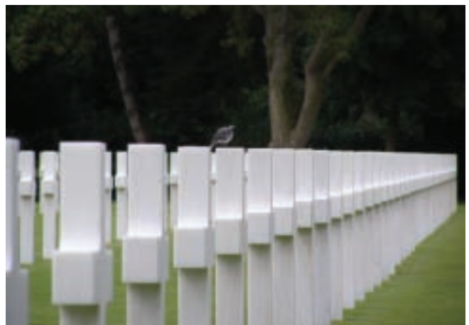
Normandy American Cemetery