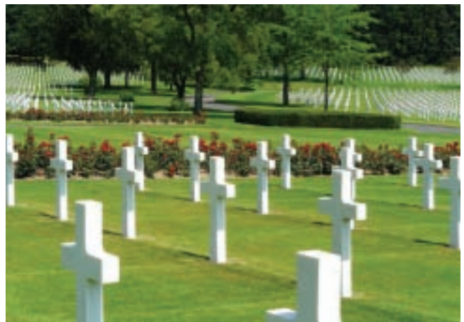
Lorraine American Cemetery