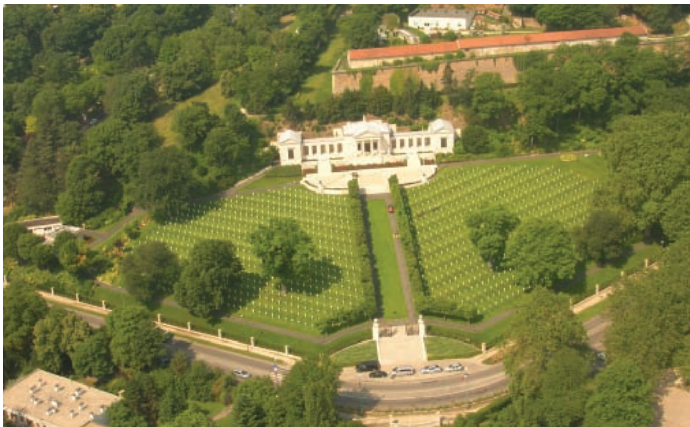
Suresnes American Cemetery