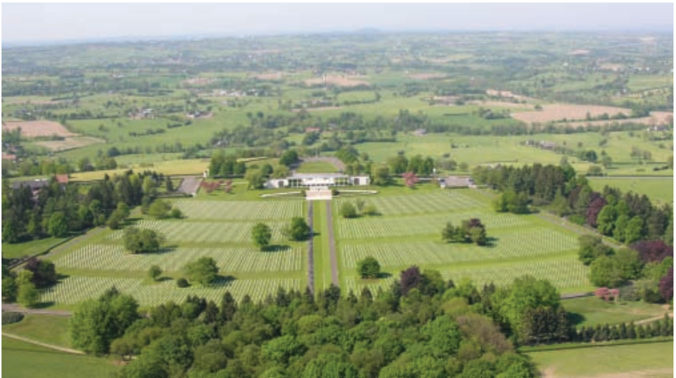
Henri-Chapelle American Cemetery