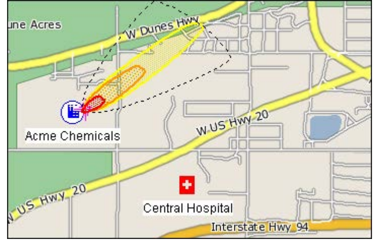
ALOHA threat zone (near the chemical facility object) displayed on a sample MARPLOT map.

Important data about these locations (such as emergency contacts, hours of operation, and chemical inventories) can be displayed in the CAMEOfm data modules to help you make decisions about the degree of hazard posed by the incident.