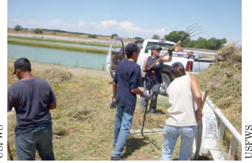
YCC members removing vegetation growth from around ponds.