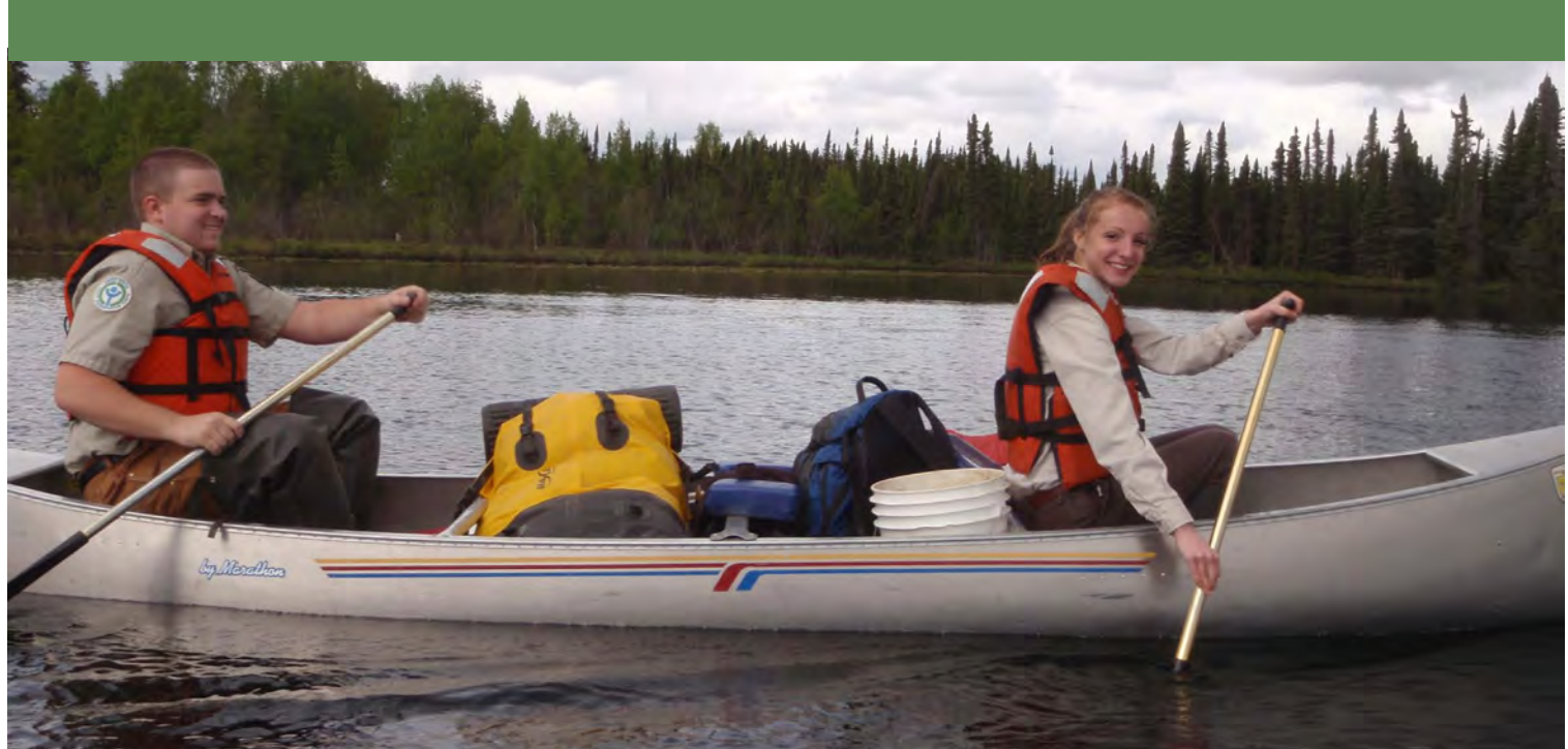
YCC interns commute to their work project site, Kenai NWR