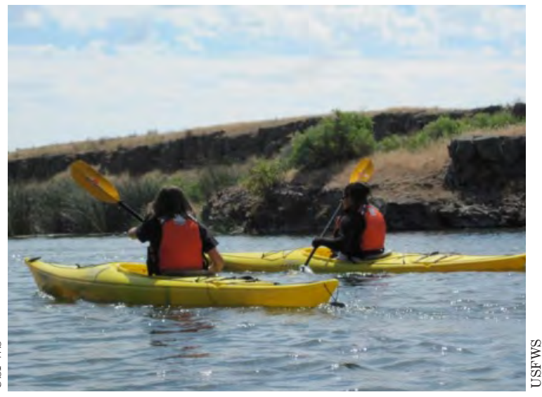
Crew interns taking in the scenery on a kayak trip