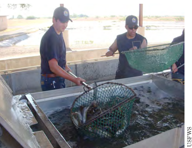
YCC Members harvesting catfish from pond 9b and later placing them in raceway (above)