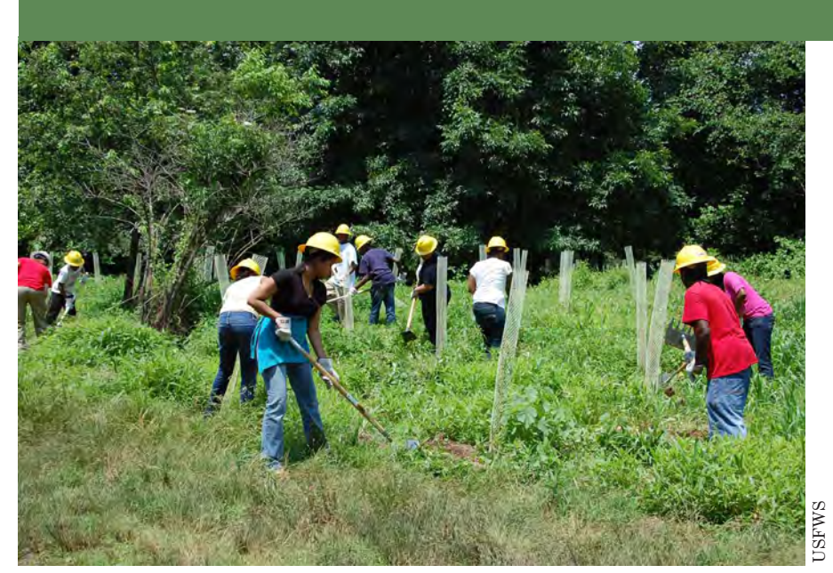
Crew \ working \ on \ clearing \ competing \ vegetation \ from \ a \ native \ plant \ restoration \ site