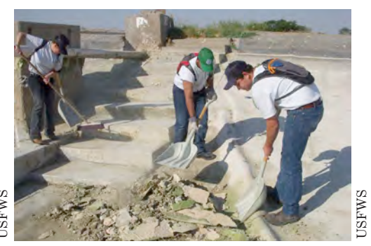
YCC members sweeping ponds and preparing for use