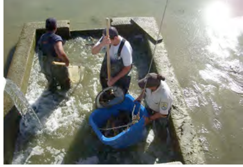
YCC Members during the harvesting process of razorbacks

Two thousand catfish were harvested from one of the ponds and placed into a raceway on hatchery property in preparation for the stocking of lakes located within the state of New Mexico. Of those two thousand, five hundred were transported to nearby Lake Van, where they were released by YCC interns and Hatchery Staff; eight hundred were transported to Zuni Pueblo; two hundred were transported to New Mexico Game and Fish; and one hundred were transported to Clovis, NM.