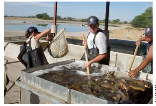
YCC Members removing razorbacks from the transporting vehicle to raceway