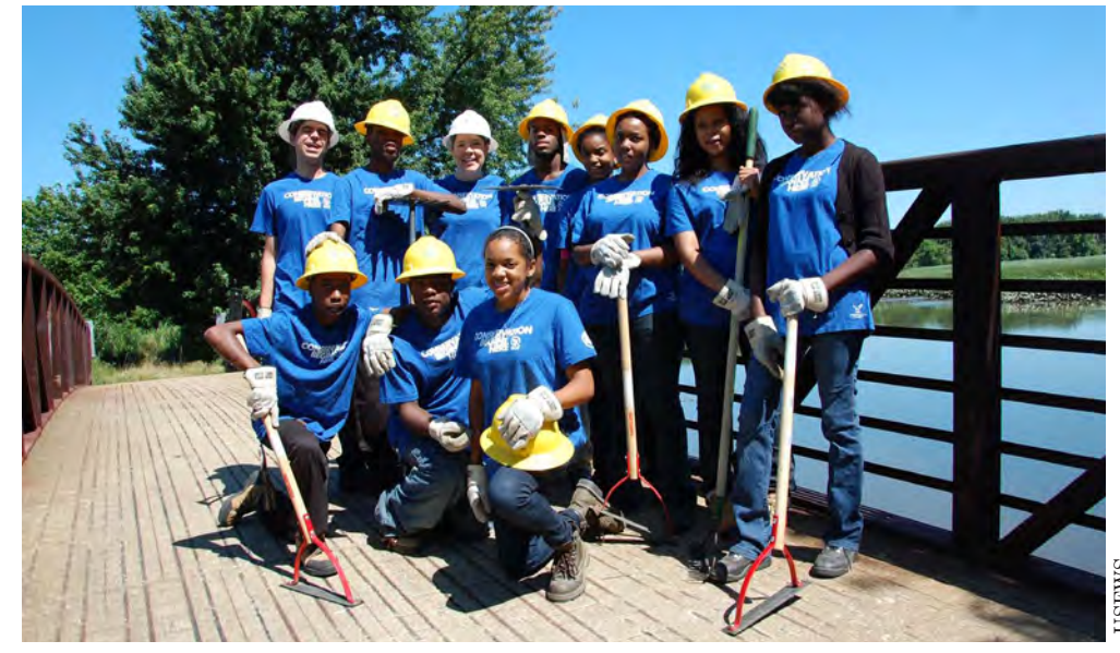
The John Heinz NWR Crew posing for a photo in between clearing brush from one of many Refuge trails

The high school students that were hired represented twenty-seven different inner city schools from Philadelphia, and they were all paid the state's minimum wage of $7.25 per hour.