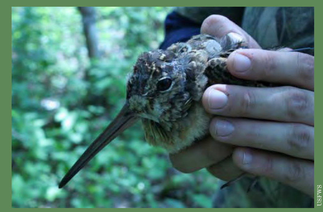
woodcock, by Serena Doose, Moosehorn NWR