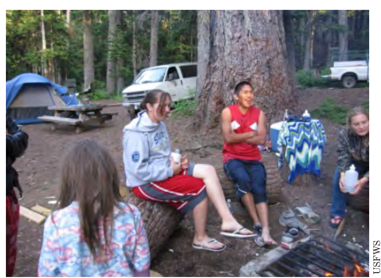
Crew relaxing around a camp fire at a spike camp