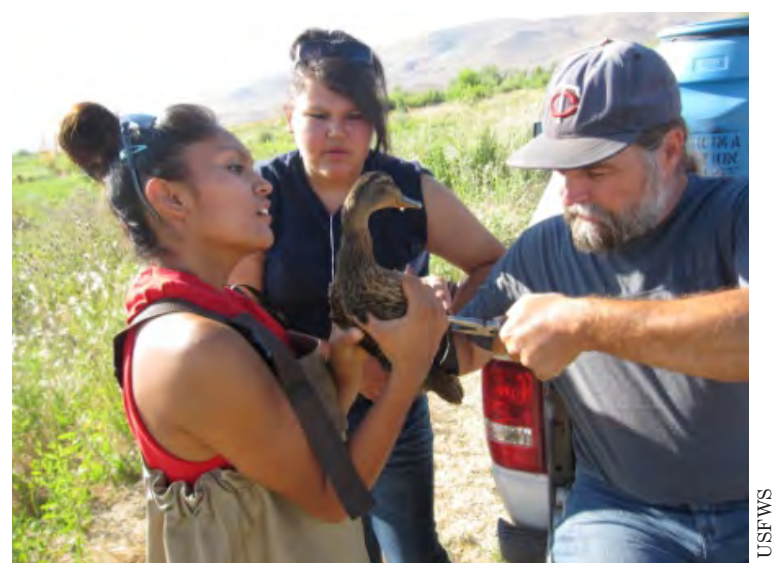
Crew\ interns\ assisting\ with\ banding\ a\ duck