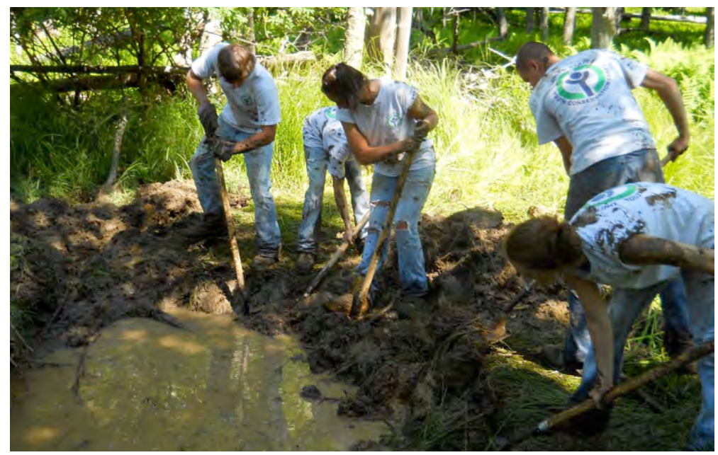
Digging out a vernal pool. A mud fight ensued.