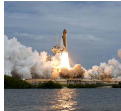
Figure 4. Final Space Shuttle Launch (STS-135), July 8, 2011

(KSC-2011-5424)