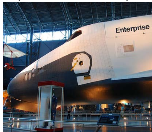
Figure 1. Enterprise on Display at the National Air and Space Museum’s Steven F. Udvar-Hazy Center