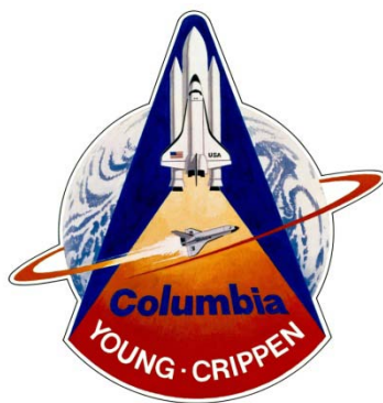
Figure 2. Mission Patch from First Space Shuttle Launch (STS-1)

Having satisfied themselves that the Authorization Act did not require changes to their placement decisions, NASA officials again considered a timetable for a public announcement. The earliest date they considered was November 15, 2010, shortly after the scheduled landing of STS-133. 15 However, during these discussions they also considered for the first time the possibility of delaying the announcement until April 12, 2011, the 30th anniversary of the first Space Shuttle launch.