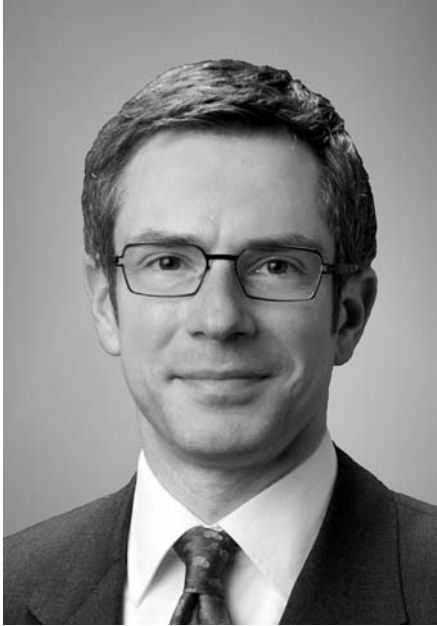
Randall Kroszner, Chairman Member, Board of Governors of the Federal Reserve System