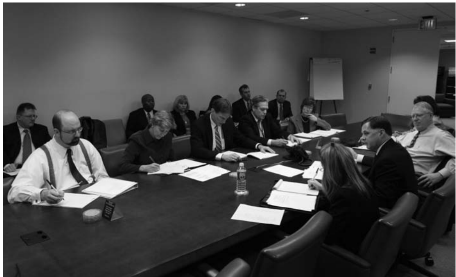
Task Force on Supervision meeting.

The task force formed a pandemic working group in 2006 to help coordinate planning and supervisory efforts that may be needed during a pandemic event. In December 2007, the working group issued pandemic guidance for use by financial institutions in identifying the continuity planning that should be in place to minimize the potential adverse effects of a pandemic event. This guidance expands upon the Interagency Advisory on Influenza Pan-