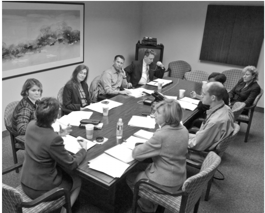
Task Force on Examiner Education meeting.

Responsible for overseeing the FFIEC's examiner education program on behalf of the Council, the Task Force on Examiner Education promotes interagency education through timely, cost-efficient, state-of-the-art training programs for agency examiners and staff. The task force develops programs on its own initiative and in response to requests from the Council or other Council task forces. Each fall, it develops a program calendar based on training demand from the five member agencies and state financial institution regulators. The task force also oversees the delivery and evaluation of programs throughout the year. During the past year, over 2,900 regulatory staff members attended training programs. (See the table for details of participation by program and agency.) In 2007, the task force welcomed a representative from the