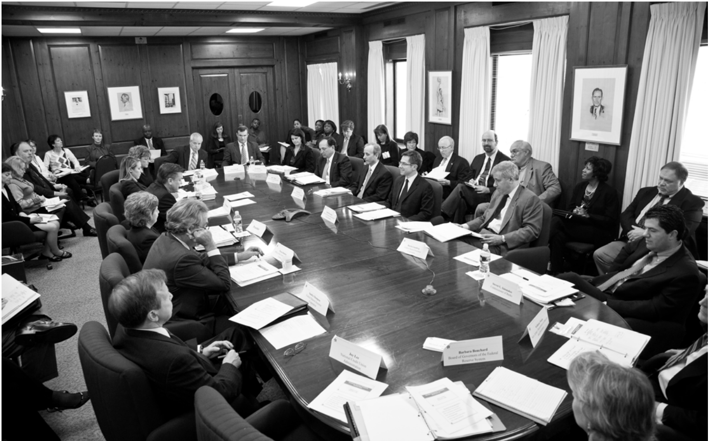
The Examination Council in Session.

The following section is a chronological record of the official actions taken by the FFIEC during 2007 pursuant to the Federal Financial Institutions Examination Council Act of 1978, as amended, and the HMDA.