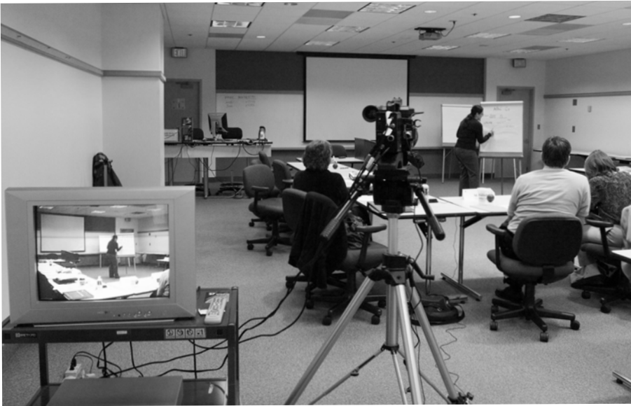
Student prepares her presentation review at FFIEC's Testifying School.