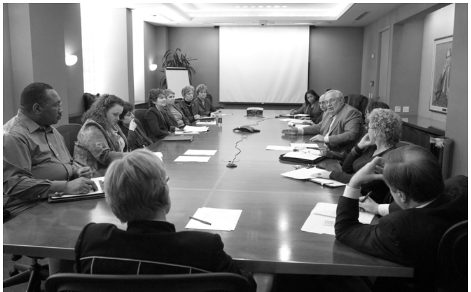
Task Force on Consumer Compliance meeting.

The task force assigned staff from each agency to work on redefining the interagency consumer compliance rating system used as part of the examination process. The revised