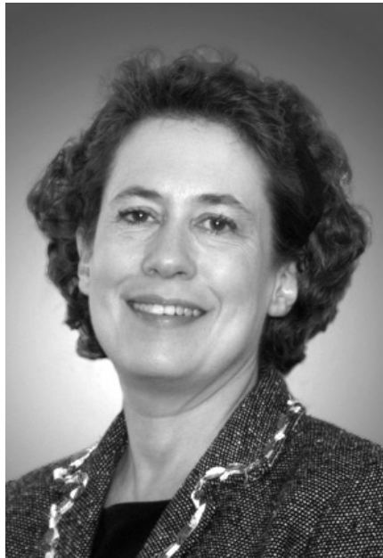
Sheila C. Bair, Vice Chairman Chairman Federal Deposit Insurance Corporation