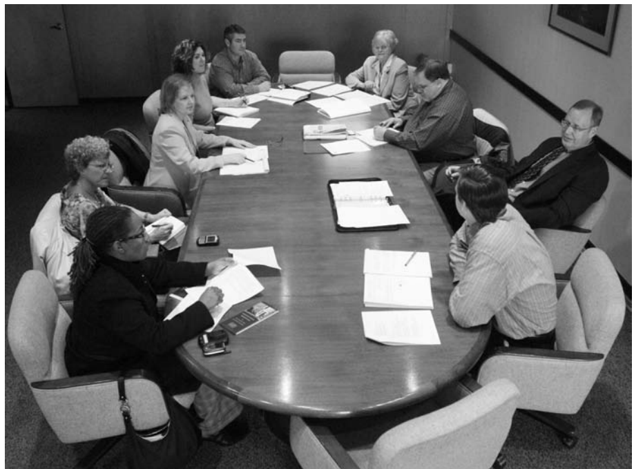
Task Force on Information Sharing meeting.

Task force members consist of representatives from FFIEC banking agencies. In 2007, the task force welcomed a representative from the State Liaison Committee as a member and participant in task force matters. Monthly meetings are held to set standards, resolve issues related to information sharing and to review the actions of its two working groups. The task force has estab-