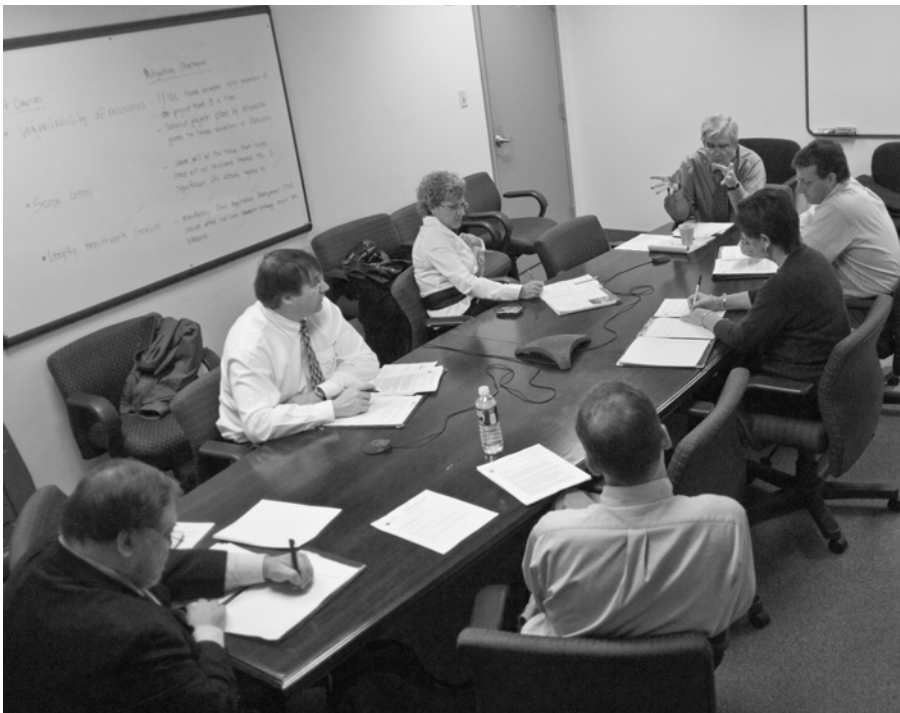
Task Force on Surveillance Systems meeting.

to reflect Call Report amendments and other revisions within a week of filing. The UBPR website will continue to be updated twice weekly during the normal Call Report filing cycle. For many banks this change will reduce a 60 day delay in receiving updated UBPR data to one week. Additionally, the task force reduced the time needed to publish final UBPR data from 25 days to 18 days.