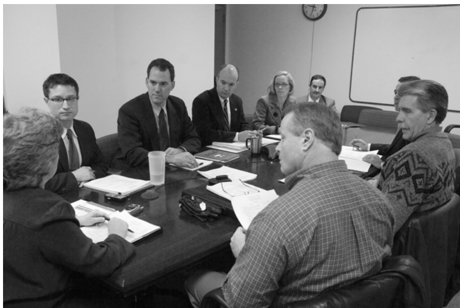
Central Data Repository Steering Committee meeting.

The law establishing the Council and defining its functions requires the Council to develop uniform reporting systems for federally supervised financial institutions and their holding companies and subsidiaries. To meet this objective, the Council established the Task Force on Reports. The task force helps to develop interagency uniformity in the reporting of periodic information that is needed for effective supervision and other public policy