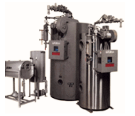
Solvent Recovery & Reprocessing Equipment