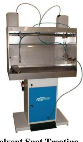
Solvent Spot Treating Machine