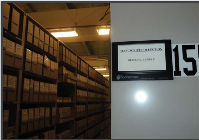
General Hershey Manuscript Collection