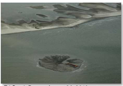
E4 South Berm – August 26, 2010

Note: Data subject to one day lag. Under normal field conditions, berm is advancing approximately 500 LF per reach per day. *Under Construction represents linear footage of berm placed; all material may not yet conform to elevation +6.