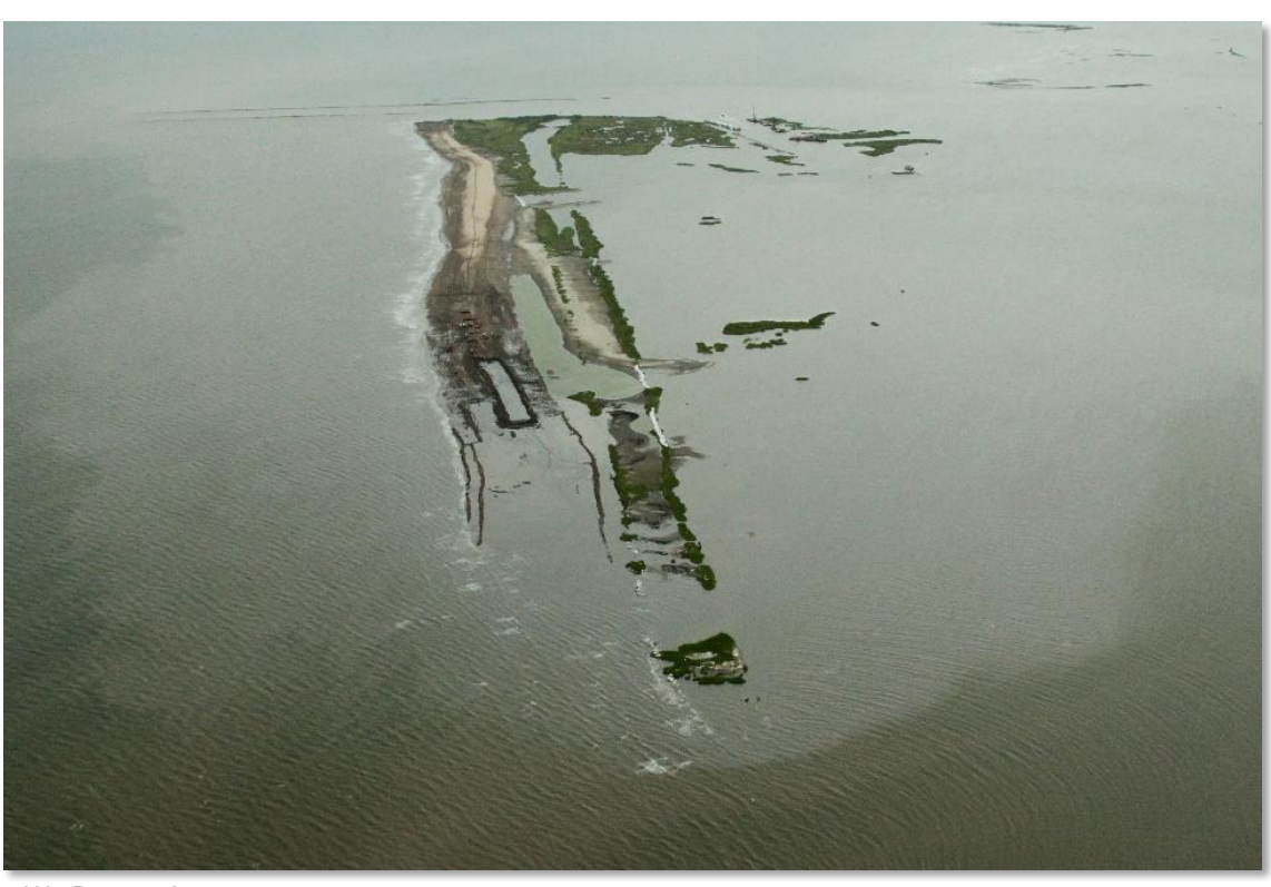
W9 Berm - August 26, 2010

Shaw Environmental & Infrastructure Group