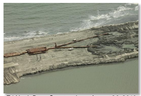
E4 North Berm Construction – August 26, 2010