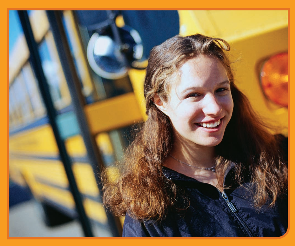
Workshop Overview, Preparation Guide, and Trainer's Outline