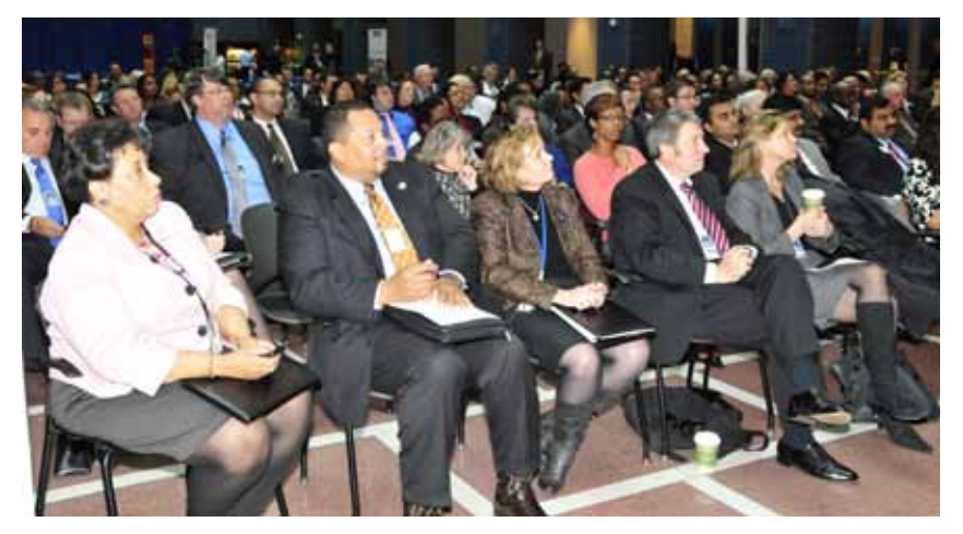
Event attendees listen to speakers