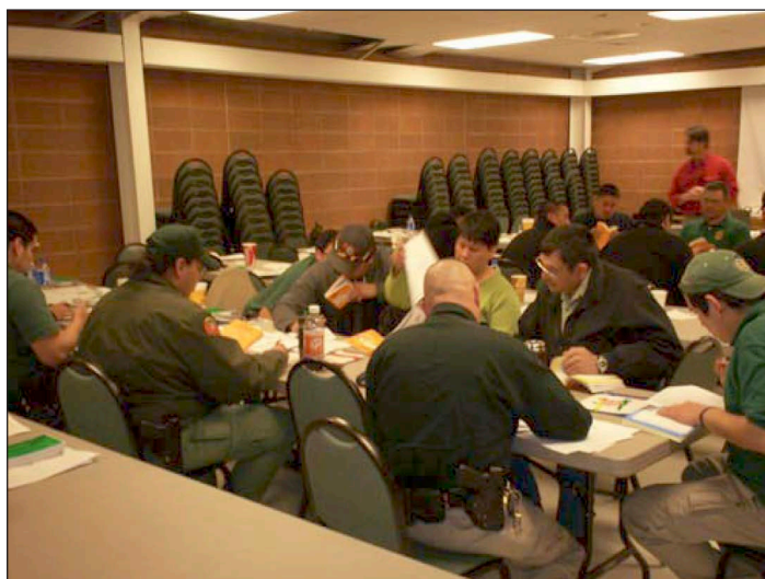
Small group activity during Clandestine Drug Lab training for members of the Crow Nation conducted by CLEAR's Workplace Safety Training Program at Jefferson State Community College.

For more information on JSCC visit: http://www.jeffstateonline.com/WST/index.aspx