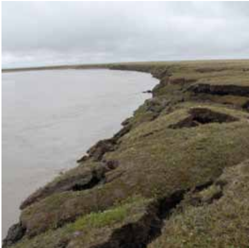
Melting permafrost, crumbling ground.

A simulated oil rig. In one game designed to teach about NOAA, players try to prevent an oil spill.