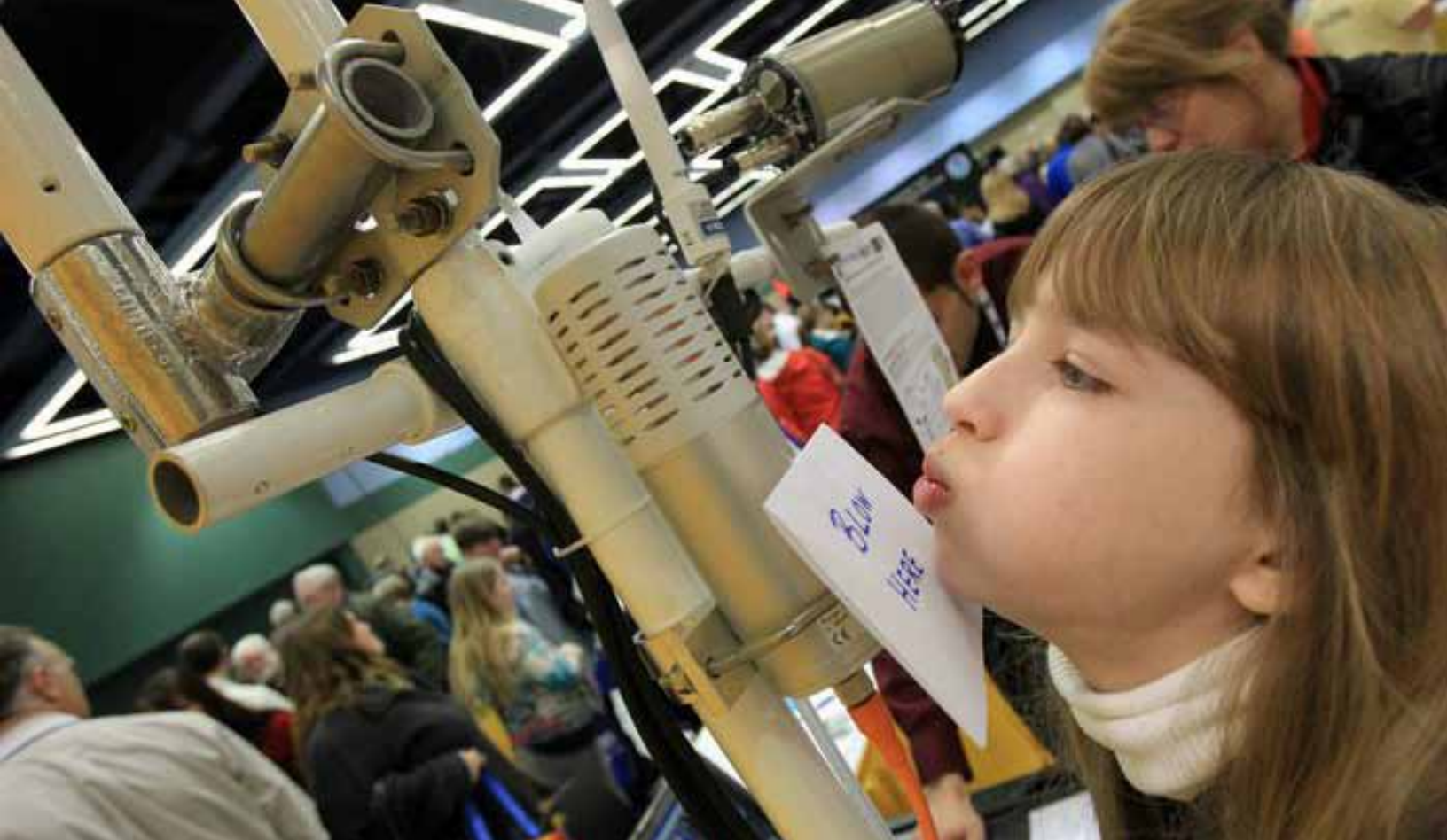
AMS WeatherFest.