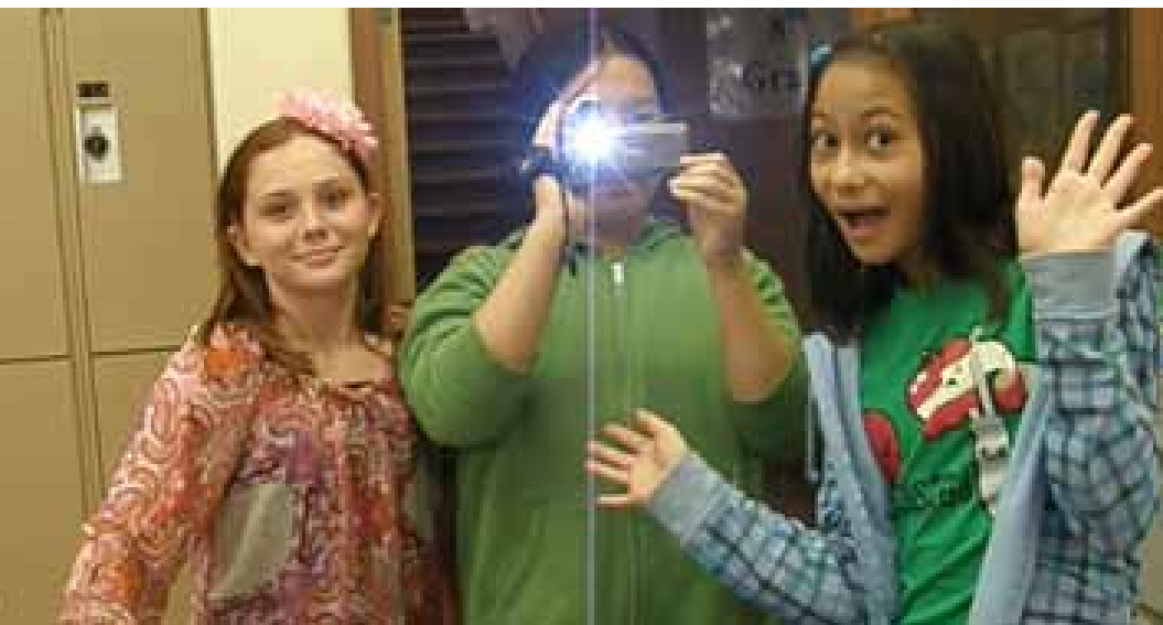
Trail Ridge Earth Explorers test filming techniques.

More: http://www.colorado.edu/atlas/earthexplorers/