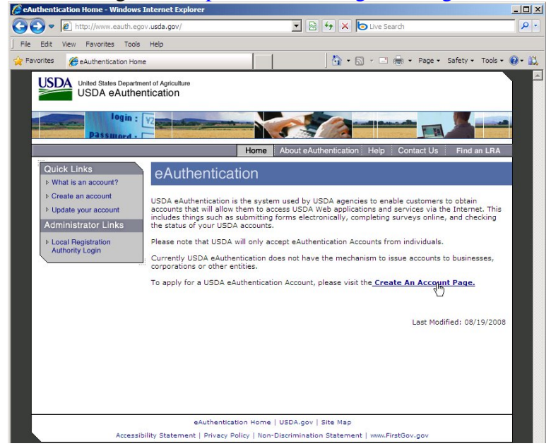
Click on Create An Account Page